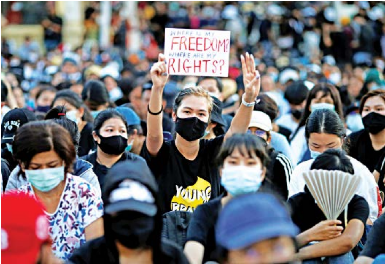
A pro-democracy protester holding a placard does a three-fingered salute at a rally to demand the government to resign, to dissolve the parliament and to hold new elections under a revised constitution, near the Democracy Monument in Bangkok, Thailand, yesterday.