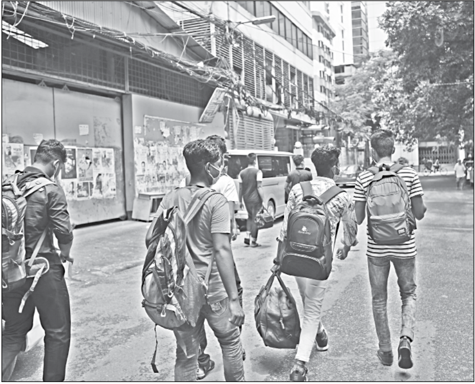
This group of young men gathered from different parts of the country with one mission in mind: getting hired. The youngsters, mostly students, were roaming the streets of the capital's Gulshan yesterday in search of opportunities. Some were scheduled to sit for interviews, while others scanned flyers and posters for job openings.