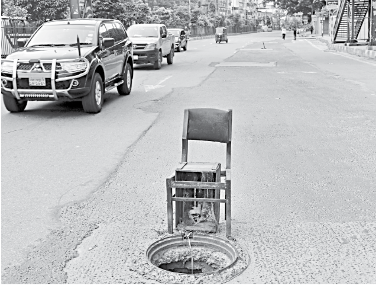
THIS CHAIR IS NOT FOR SITTING ... With this manhole cover in the middle of the street gone missing in the capital's Arambagh, locals have placed a broken chair frame and a wooden box to demarcate the gape, so vehicles can steer clear of danger. The photo was taken yesterday.