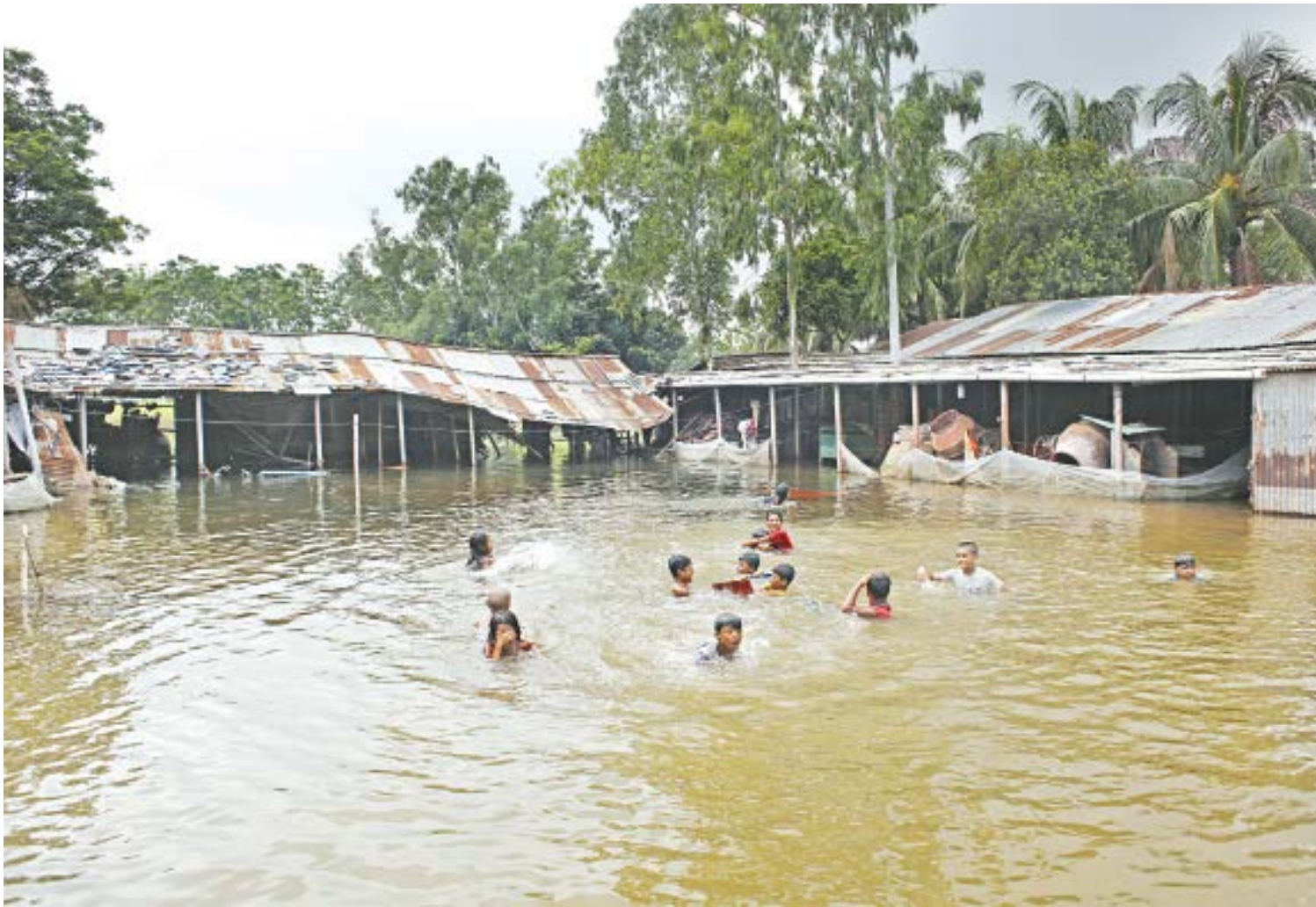
It is hard to believe that this is the yard of a compound of dwellings and a tiles factory at Bhakurta Mugrakanda in Savar on the outskirts of the capital. Children are bathing in the yard that has been under floodwater for around a month. This photo was taken yesterday.

"Since the medicine will be purchased centrally, SEE PAGE 10 COL 2