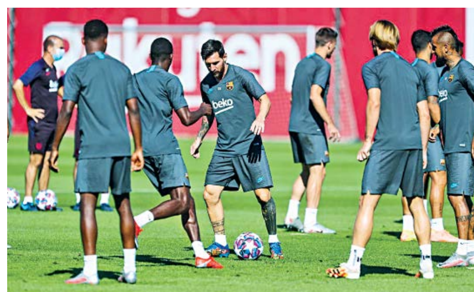
Lionel Messi and his Barcelona teammates will be desperate to dribble past Napoli in tonight's fixture of the Champions League, which remains their only chance of a silverware this season.

"They were strong and from a psychological point of view they fed off our fragility," said then-coach Ernesto Valverde after the Liverpool loss. "They came at us and we failed to react," said Sergio Busquets of Roma.