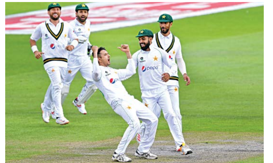
Pacer Mohammad Abbas took two early wickets on Thursday evening as Pakistan consolidated the stronghold provided by Shan Masood's century in the first Test against England at Old Trafford.

Abbas also removed opener Dom Sibley on his way to close figures of 2-24, with towering left-arm quick Shaheen Afridi making the initial breakthrough with just the fourth ball of the innings when Rory Burns was plumb lbw.