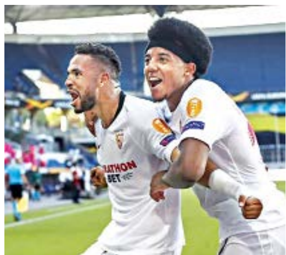
Sevilla's Youssef En-Nesyri (L) celebrates his opener against AS Roma during their Europa League fixture at the MSV Arena in Duisburg on Thursday.

Zidane said it was a personal decision but would not be drawn on details, insisting "there are things that have to stay in the changing room". Asked about his future, Zidane said: "Bale is a Real Madrid player, nothing has changed and I respect him like everyone else."