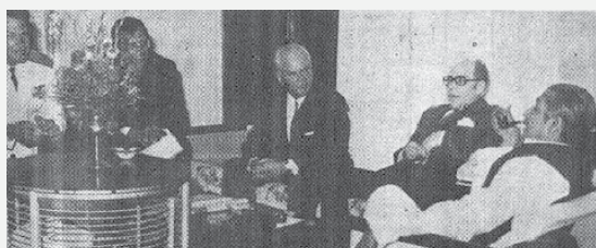
A Soviet delegation calls on Bangabandhu at his official residence on July 17, 1972.