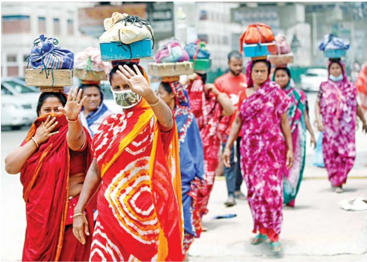
IN NO MOOD TO TALK... As life approaches normalcy in the capital, a few members of the nomadic Bede community have come to town looking for ways to earn some money. Exhausted and feeling overlooked, they were in no mood to talk to a journalist who was “just here for the photos”. This photo was taken from Rajarbagh area yesterday.