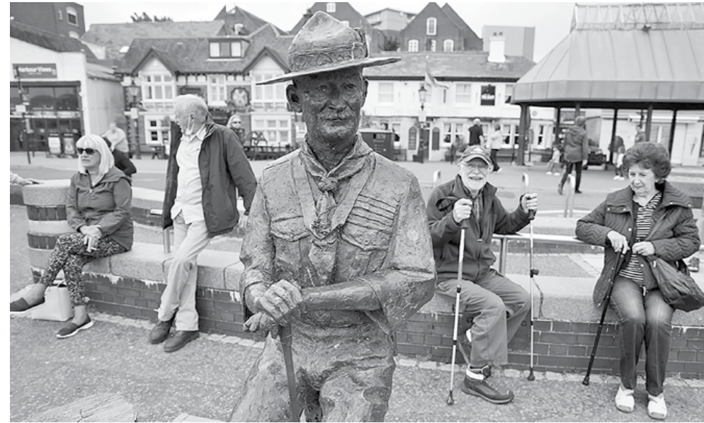
A statue of Robert Baden-Powell is seen in Poole, Britain, on June 11, 2020.