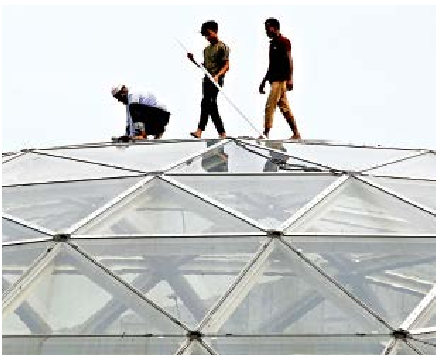
Standing atop a dome-shaped structure, these three workers go about their daily grind on a Sunday morning in Bijoy Sarani. Like them, thousands in the capital work in the construction sector without any safety measures and equipment, putting their lives at risk.