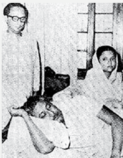
Bangabandhu, who is sick, is attended by Begum Mujib and General Secretary of Awami League Zillur Rahman. The photo was published in The Daily Ittefaq on July 6, 1972.