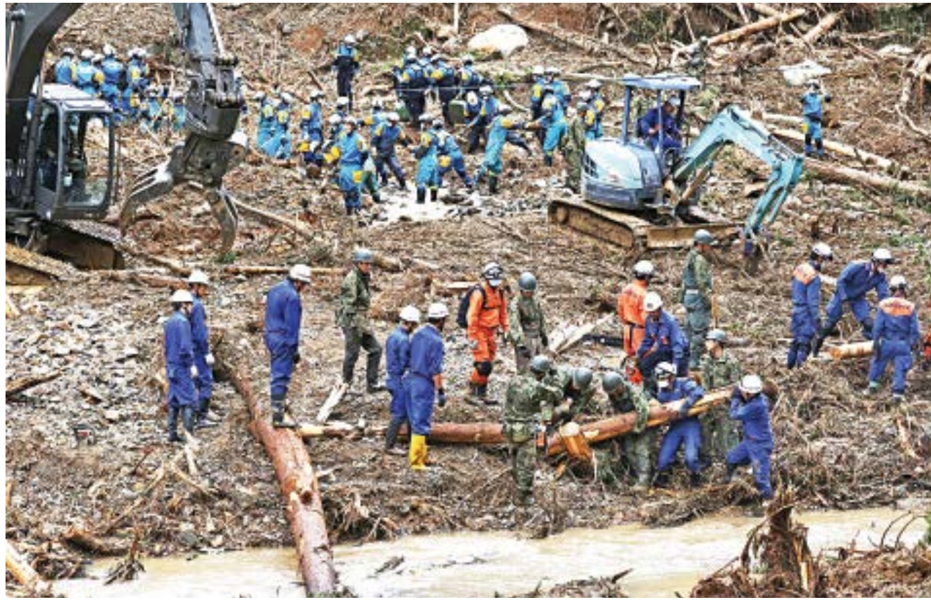
Rescue workers search for missing people at a landslide site caused by torrential rain in Tsunagi town, Kumamoto Prefecture, southwestern Japan, yesterday.