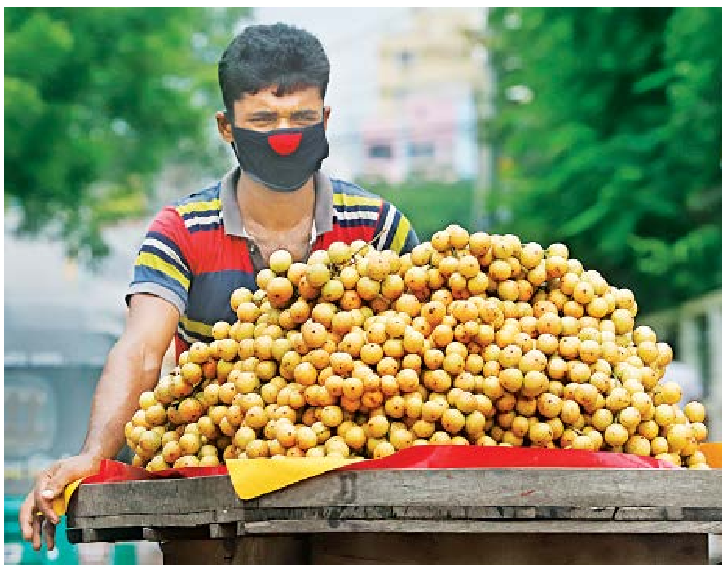
A seller pushes his cart full of lotkon, an underrated delicacy of the season. He sells it for around Tk 100-150 per kg, and it's best to grab some before the season is over. This photo was taken at Dhaka's Sabujbagh area last week.