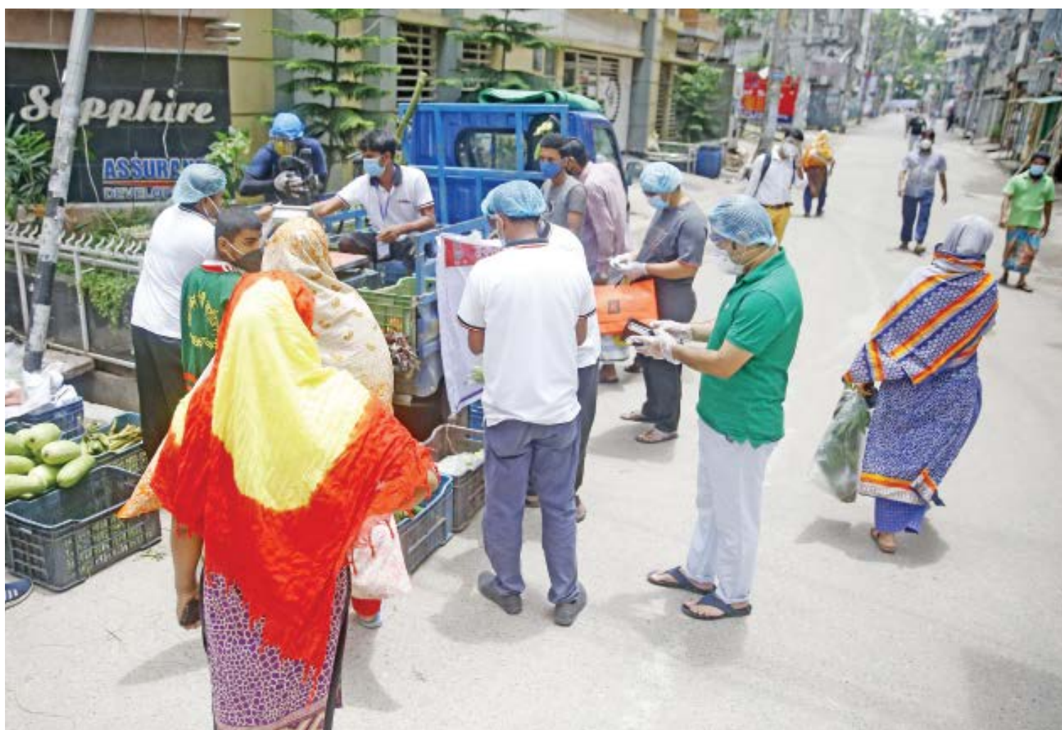
Locals gather near a truck to buy vegetables and other essentials in the capital's Wari area. Since Wari was locked down on Saturday to stop the spread of the coronavirus, several online shopping services have been sending these goods to the area.