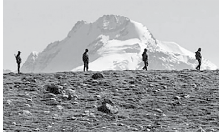
It seems the only visible policy is to continue with the claim and counterclaim until an accord is reached on multiple key but fuzzy issues in other areas.

In the late fifties, India, believing the above mentioned lines to be its international border, started building outposts in the forward regions. Since China didn't recognise the lines right from the start it objected. After many rounds of talks at different levels right from the top down, China offered a compromise to give up claim on Arunachal Pradesh which it considers to be South Tibet; in exchange India should give up claim on Aksai Chin in the north.