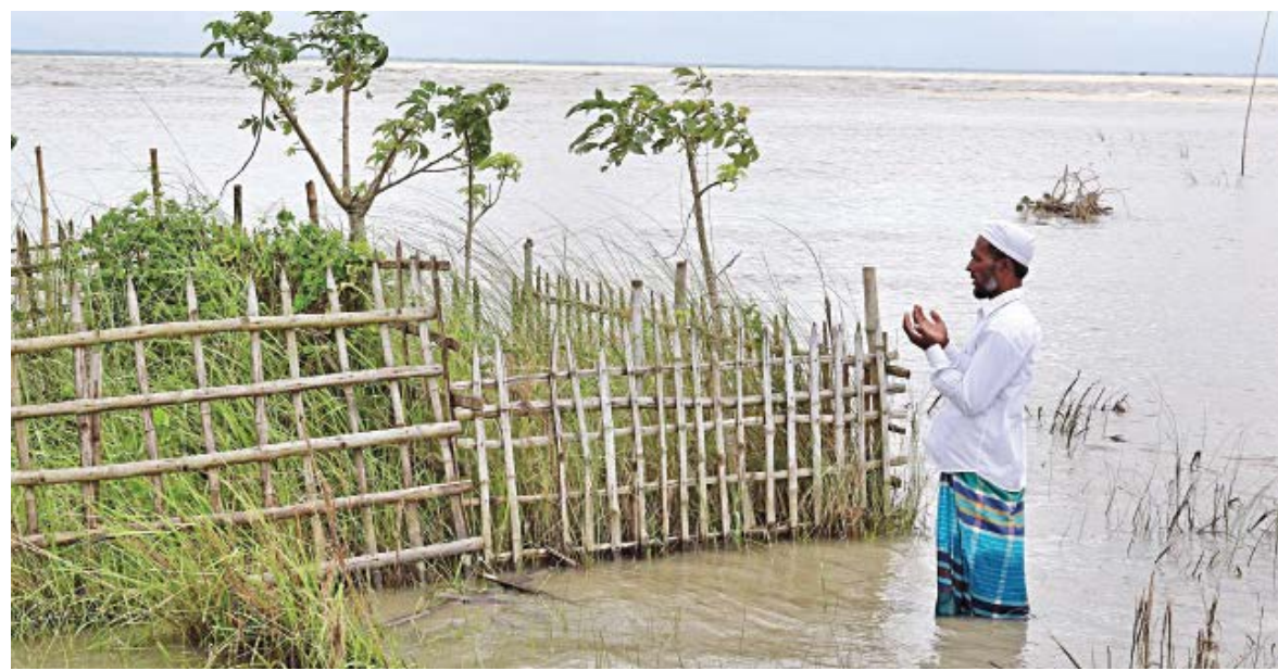
Standing in knee-deep water, a man prays near the grave of his loved one in the flood and erosion-hit Kajirsura union of Madaripur's Shibchar upazila. The Padma has already devoured a nearby mosque and the man fears it could be the last time he would be able see the grave. The photo was taken yesterday.