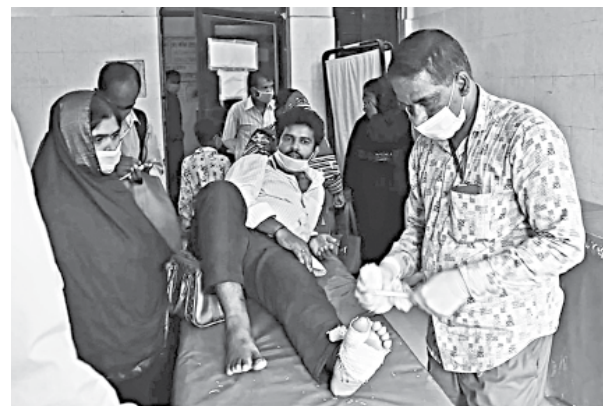
After receiving treatment from a so-called local physician for over a week, this road accident victim from Indurkani upazila came to know that a tendon of his left leg was cut off.