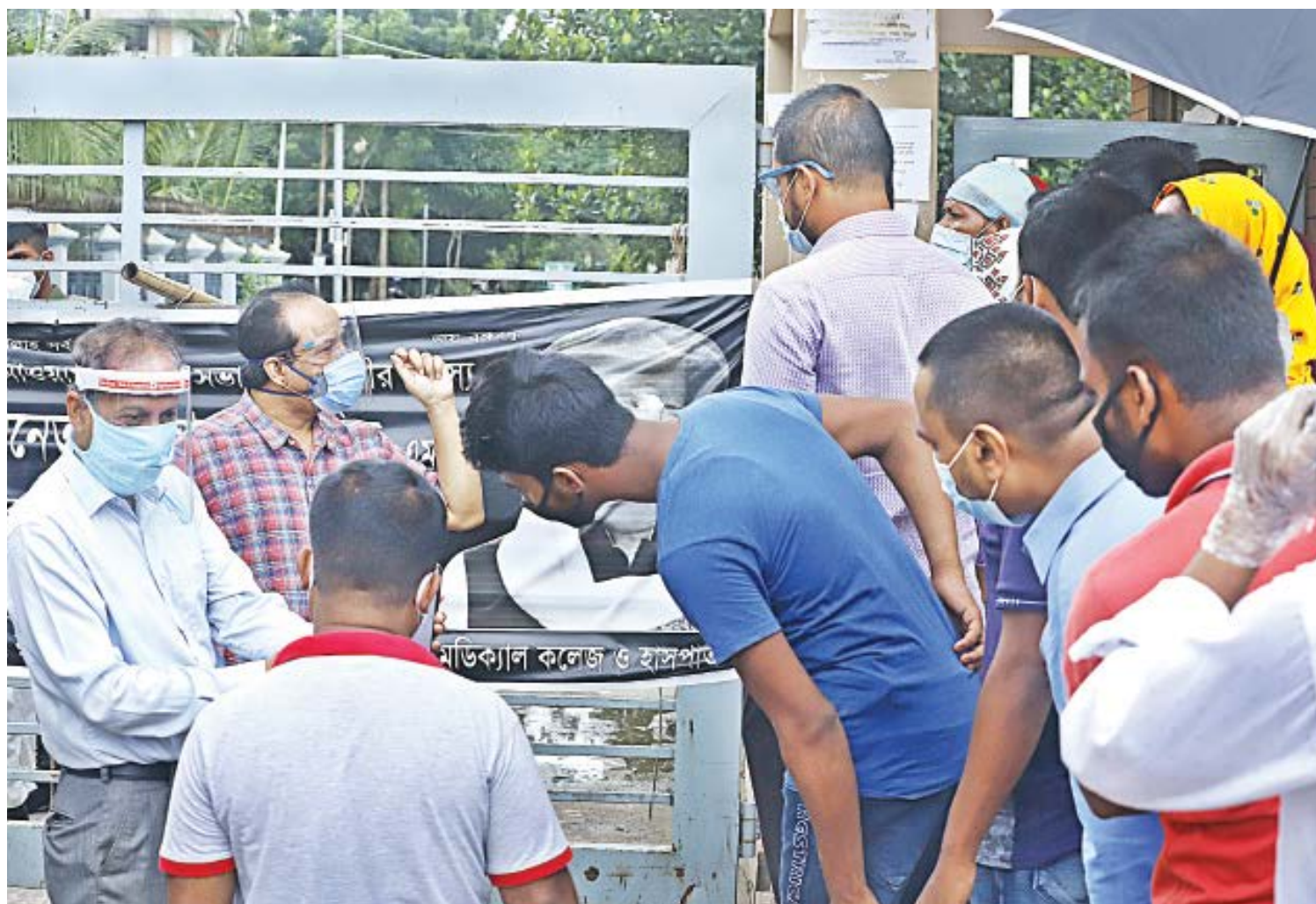
Two doctors speaking to the people waiting in a queue for coronavirus testing in front of Mugda Medical College Hospital in the capital yesterday. The hospital has a capacity to test 190 samples every day. It issues 80 tickets for walk-in patients and keep the rest for staffers and the patients admitted to the hospital.