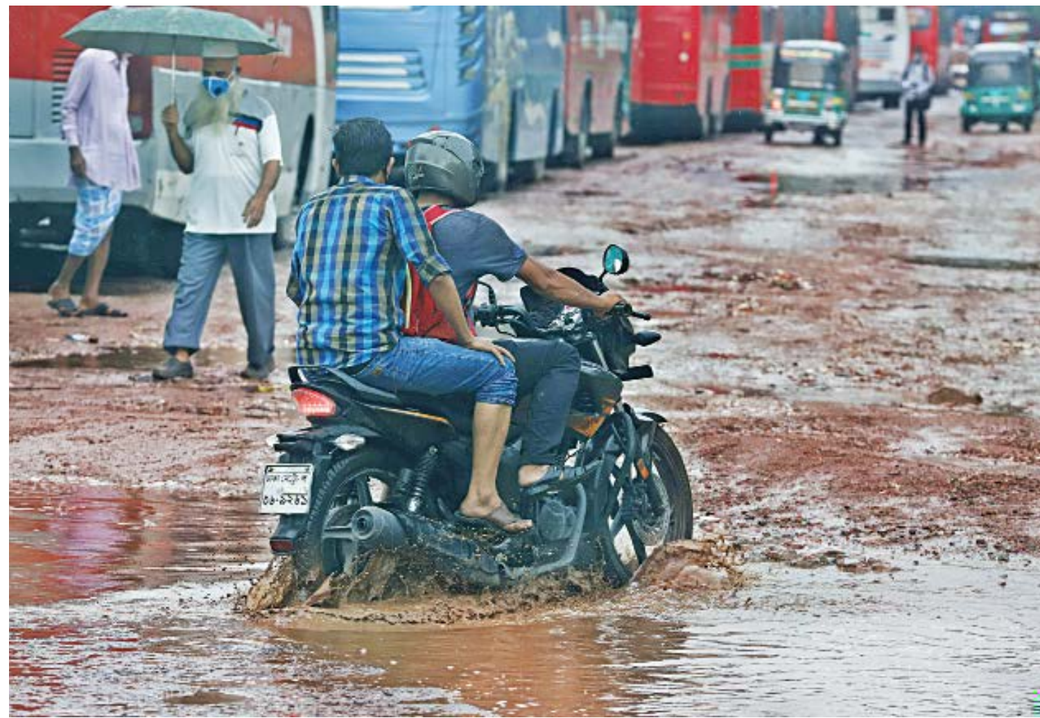
A motorcycle struggles to move on the battered road in front of Kamalapur Railway Station in the capital. Locals say the road has been in such a condition for the last eight months. The road is heavily used by intercity buses, trucks, and articulated lorries that carry goods to and from Chattogram port.