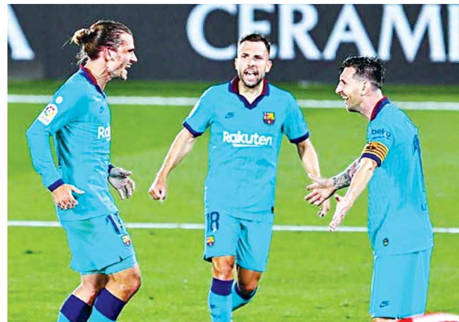
Everything seemed to fall into gear for Barcelona with Antoine Griezmann (R) scoring a spectacular goal against Villarreal, assisted by Lionel Messi as they cut down Real's lead to four after Sergio Ramos (L) penalty at Bilbao had stretched Los Blancos' lead to seven earlier in the day.