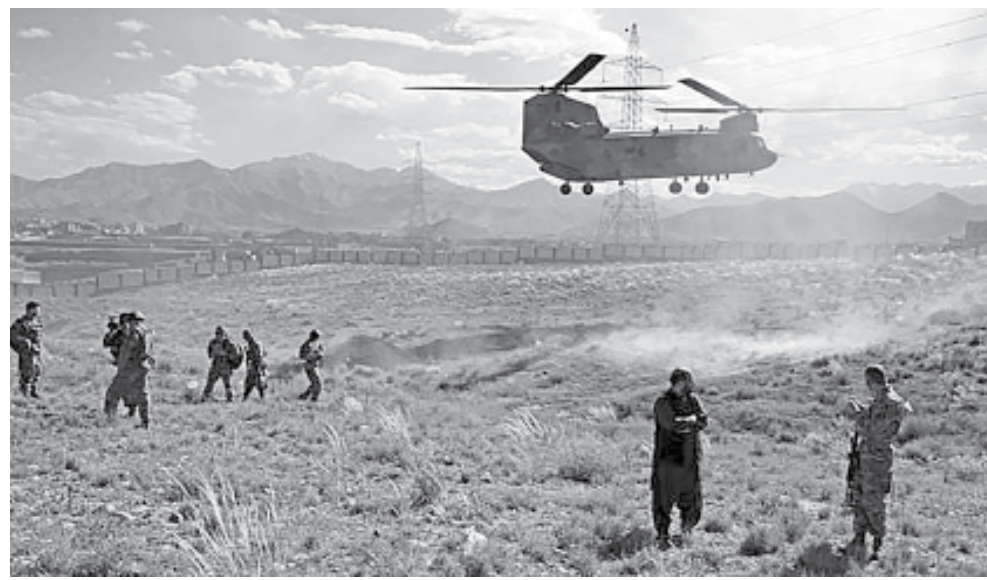
A US military Chinook helicopter in Afghanistan in 2019.