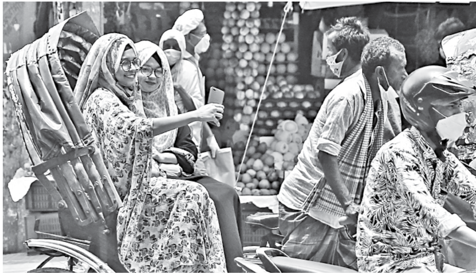
Masks on at all times, until it's time to take a selfie. Two girls document a now-rare rickshaw ride together at Dhaka's Tikatuli area, hoping this small break from the mask won't cause much harm.