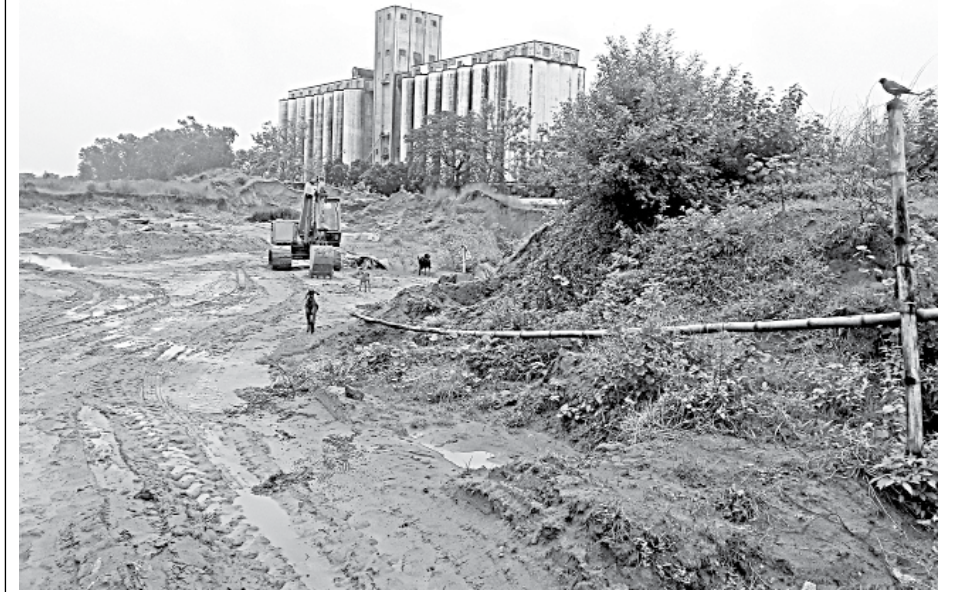
Remains of government-owned sand, illegally sold earlier, being cleared from a railway land in Ashuganj upazila of Brahmanbaria. The photo was taken on July 1.