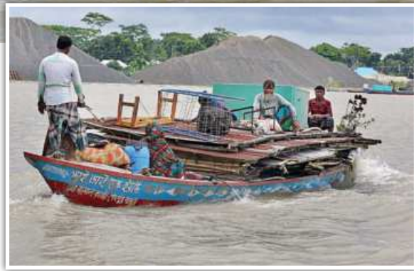
Floodwater inundated the premises of Nuruddin Matborerkandi Model High School in Kajirsura union of Madaripur's Shibchar upazila after the Padma swelled up a couple of days ago. The mighty river has turned furious and devoured several establishments in the union. Locals fear it might also destroy the school. Inset, a family moving all its belonging to safety on a boat in the area yesterday. Story on page 12.