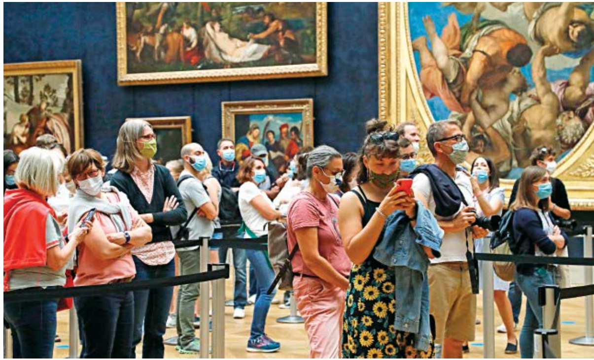
Visitors wearing face masks queue in front of Leonardo da Vinci's masterpiece “Mona Lisa” also known as “La Gioconda” at the Louvre Museum in Paris, France yesterday, on the museum's reopening day.

The 10-minute show shifted to messages of gratitude for medical personnel in the frontlines of the pandemic as well as all South Koreans for their collective efforts.