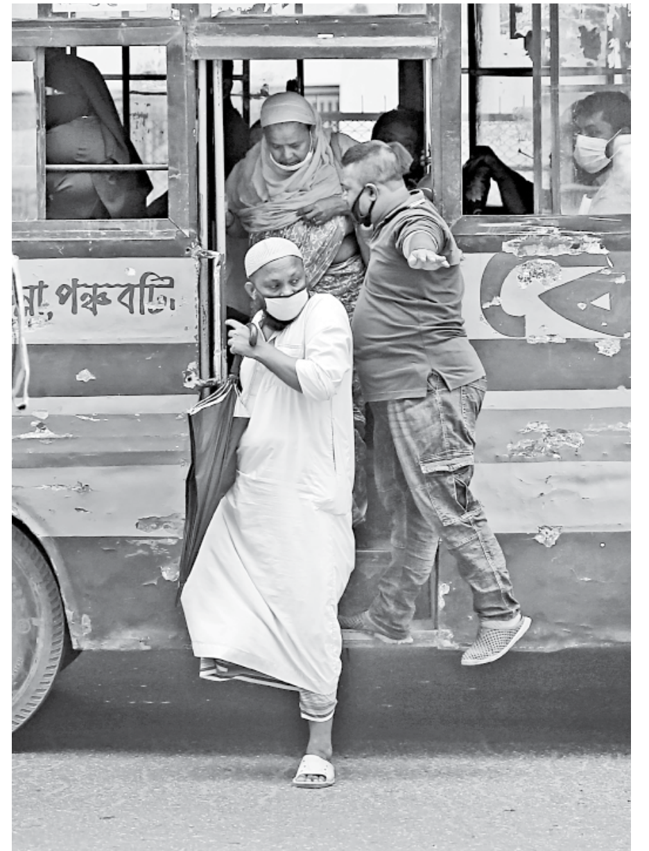
The pandemic may have made buses take in fewer passengers, but disregard for traffic rules continue. This bus was spotted dropping off a passenger in the middle of a road yesterday in the capital's Gulistan.