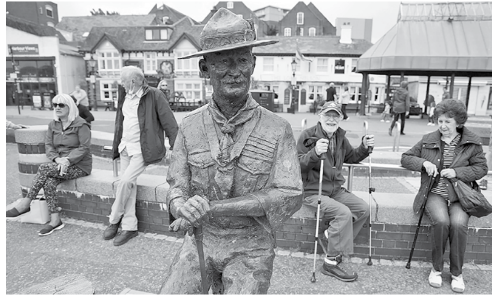
A statue of Robert Baden-Powell is seen in Poole, Britain, on June 11, 2020.