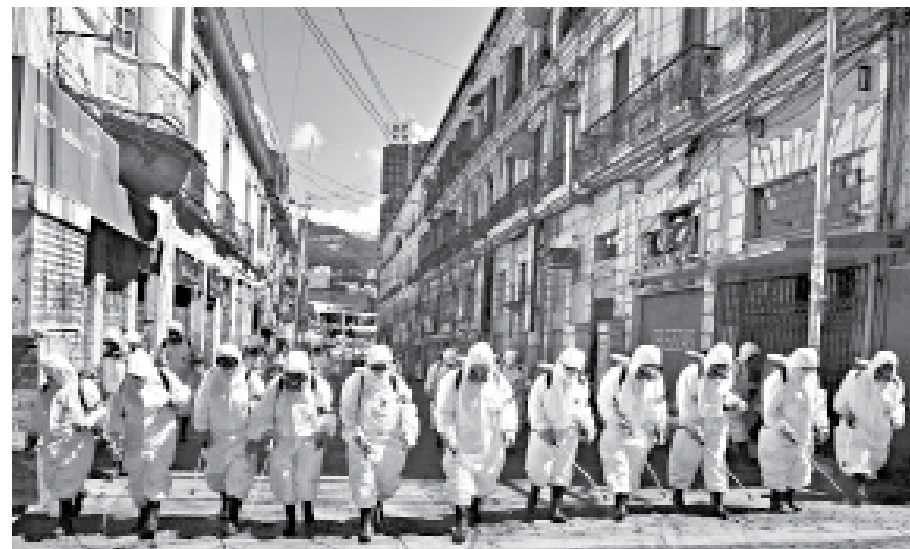
Through sustained efforts of many years and effective three-tier system of local government was established in Kerala, whose dividends the state derived during the current coronavirus pandemic.

With the realisation that they were in it together, Rapid Response Teams ensured the safety of all, irrespective of race, religion and political identity, which