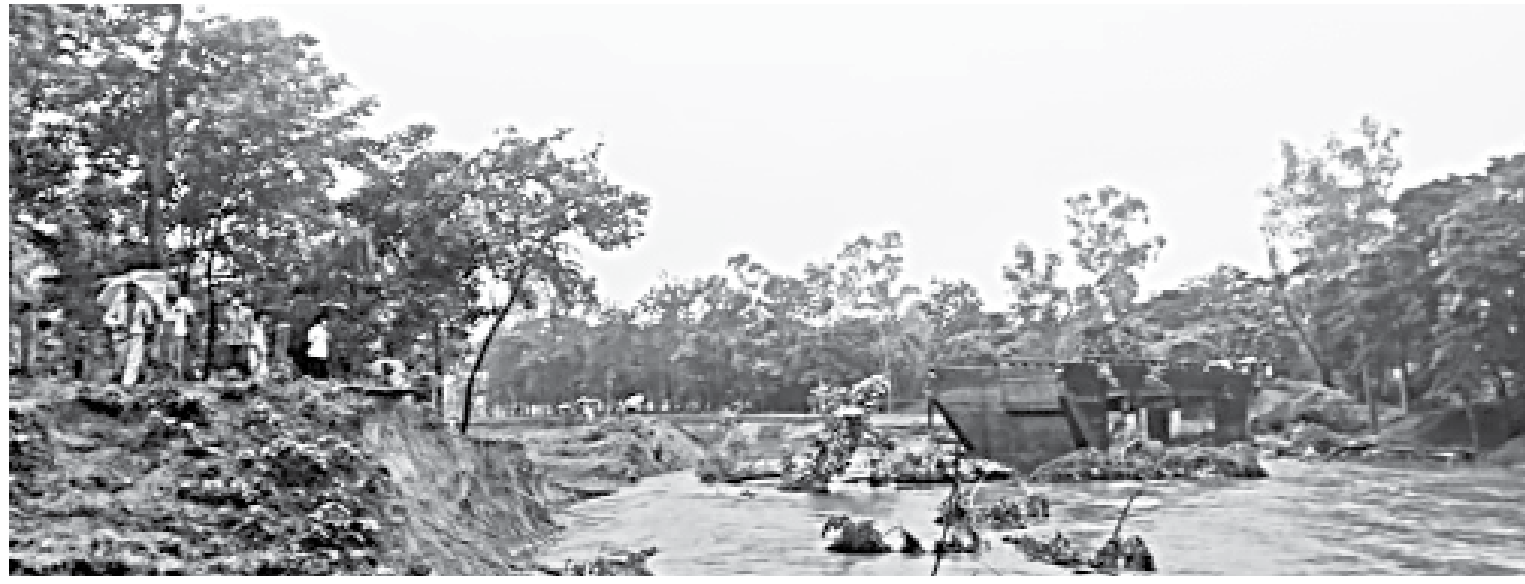
The bridge on the Rangapani river, in Khayerbagan area of Debiganj upazila under Panchagarh, now lies without its approach road. The road was washed away in flash floods on Friday.