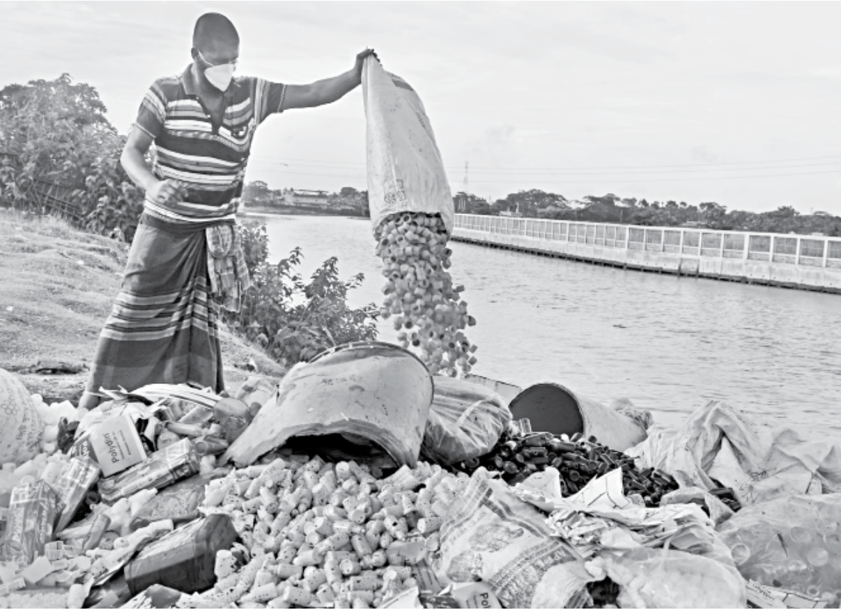
After seizing the counterfeit products from a residence in Barishal city's Sagardi Darga Bari, authorities destroyed them yesterday. The criminals ran the operation for the last two years, supplying fake products to the capital's Mitford wholesale medicine market.