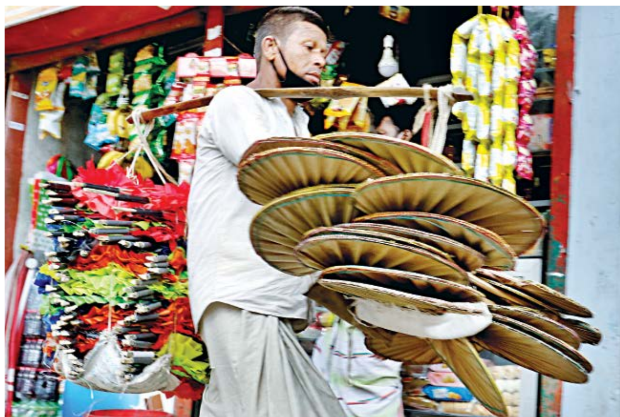
With the mercury rising, a hawkler has his hands full with hand-woven fans as he conducts business on the streets in front of Shaheed Minar in the capital yesterday.