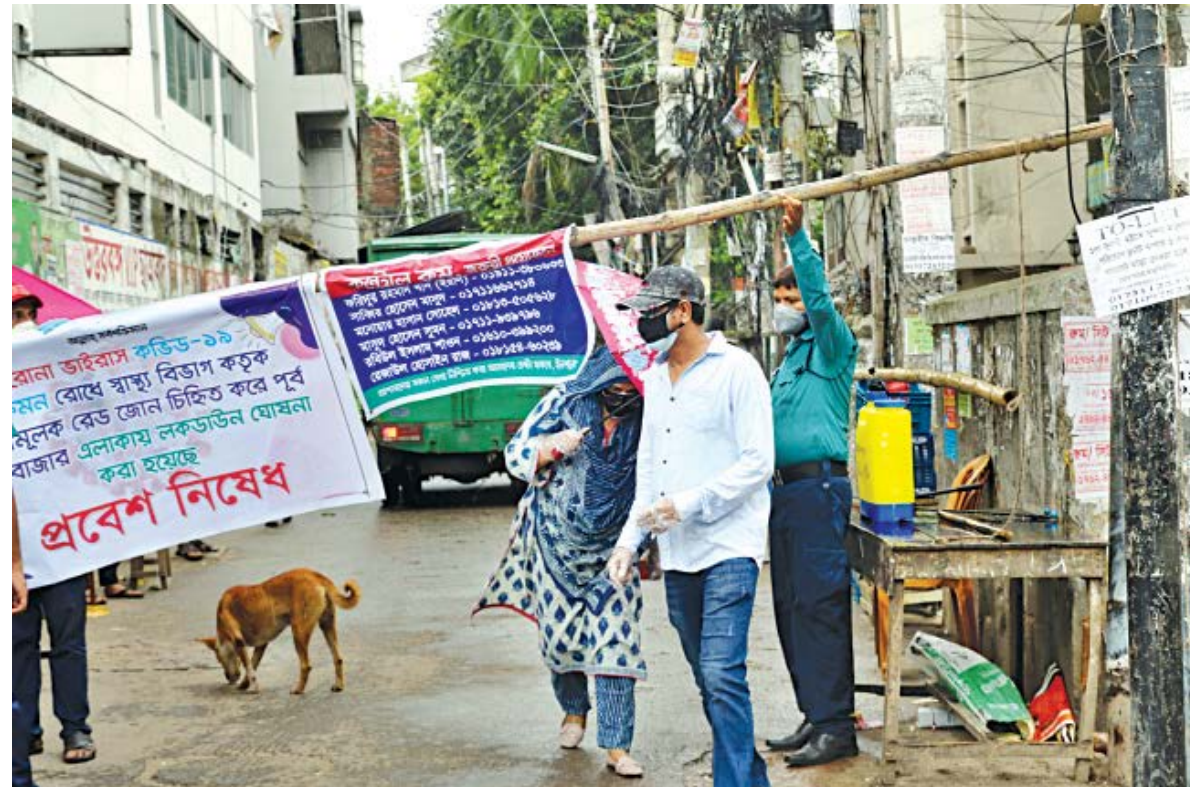
A man and a woman leaving East Rajabazar yesterday as a police official looks on. Despite the area being categorised as a red zone, which signifies it as a hotspot for coronavirus infection and therefore under complete lockdown, people have been coming and going by using various excuses when stopped by law enforcers.