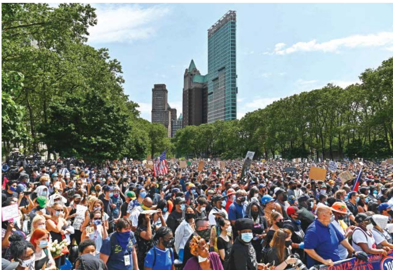
Protesters gather at Cadman Plaza in Brooklyn, New York on Thursday to condemn the killing of George Floyd. Floyd, a 46-year-old black man suspected of passing a counterfeit $20 bill, died in Minneapolis on May 25 after Derek Chauvin, a white police officer, pressed his knee to Floyd's neck for almost nine minutes.