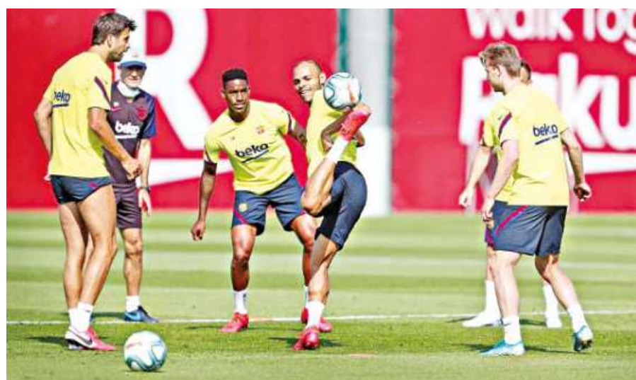
Barcelona players continued to sweat it out at the Joan Gamper training ground ahead of La Liga's slated June 11 restart, but Lionel Messi has sat out training since Wednesday with a thigh strain.

The Portuguese champions missed the chance to move clear at the top of the table after being held to a 0-0 draw by lowly Tondela. The top two are now level on 60 points with nine rounds of matches remaining.