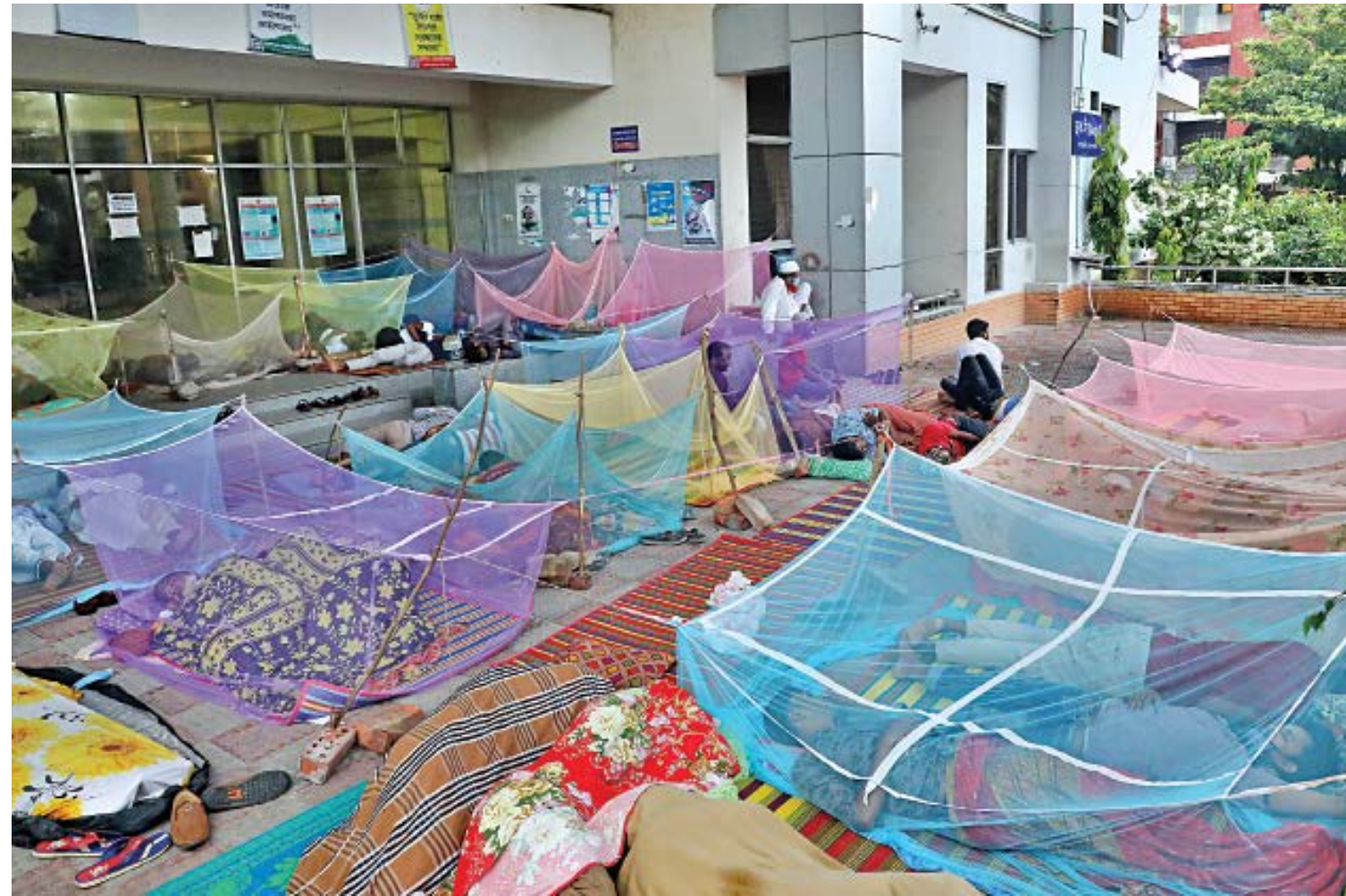
Relatives of patients sleeping in close proximity under mosquito nets in the driveway of Dhaka Shishu Hospital at dawn yesterday. As part of measures to curb the spread of coronavirus, only mothers are allowed as attendants inside the hospital to maintain social distancing, but it has had the opposite effect outside the institution's walls as this scene is repeated daily with 40-50 people crowding together.