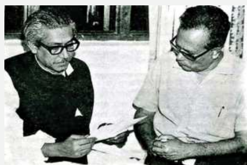
Shilpacharya Zainul Abedin calls on Bangabandhu at his official residence on June 2, 1972.