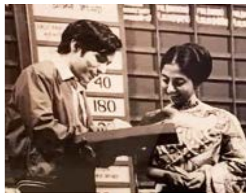
Young Mustafa Kamal Syed announcing the historic 1970 national election result.

There are a few people that I consider to be true stalwarts of television, including