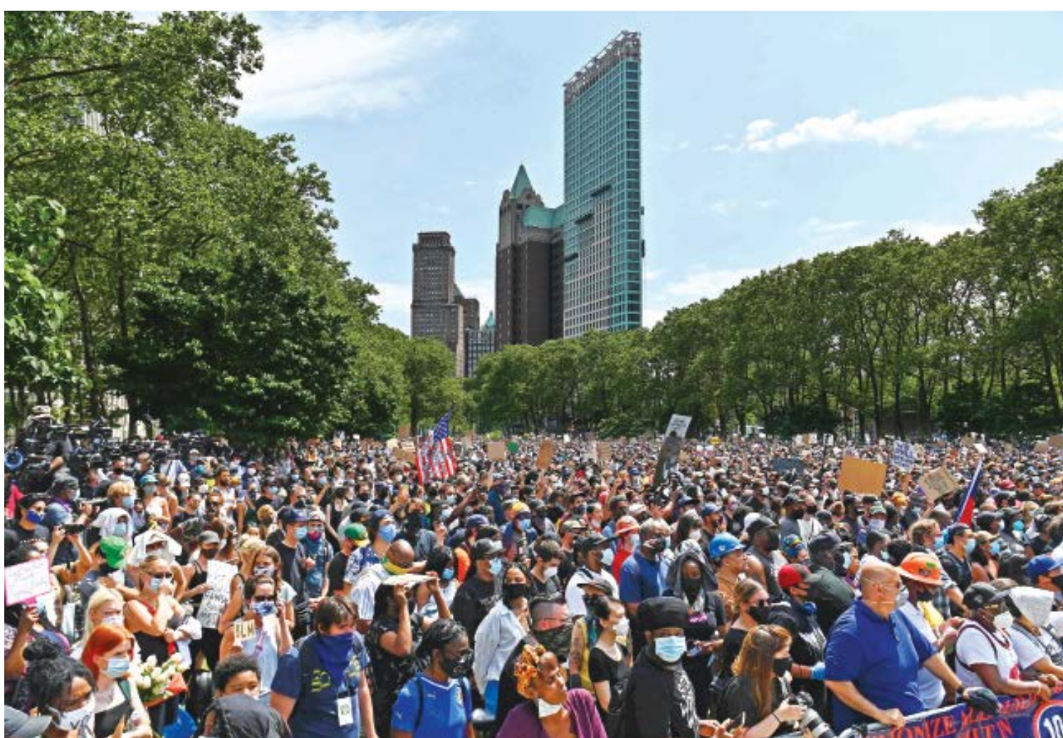
Protesters gather at Cadman Plaza in Brooklyn, New York on Thursday to condemn the killing of George Floyd. Floyd, a 46-year-old black man suspected of passing a counterfeit $20 bill, died in Minneapolis on May 25 after Derek Chauvin, a white police officer, pressed his knee to Floyd's neck for almost nine minutes.