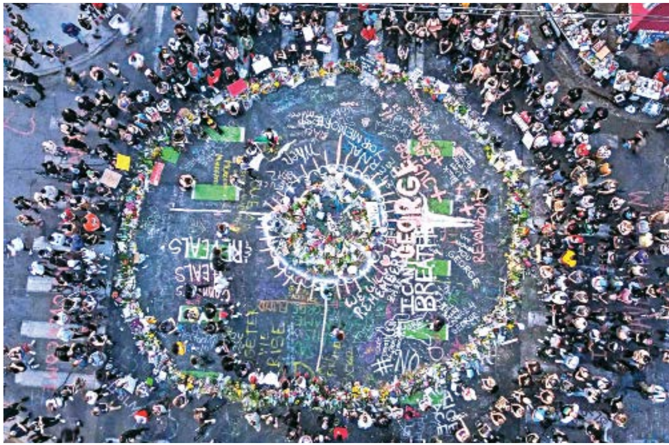
Ariel view of protestors gathered near the makeshift memorial in honour of George Floyd marking one week anniversary of his death, on Monday in Minneapolis, Minnesota.

The people who are on the streets are in