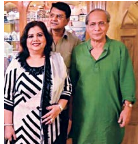
(From left) Runa Laila, Alamgir and Mustafa Kamal Syed.