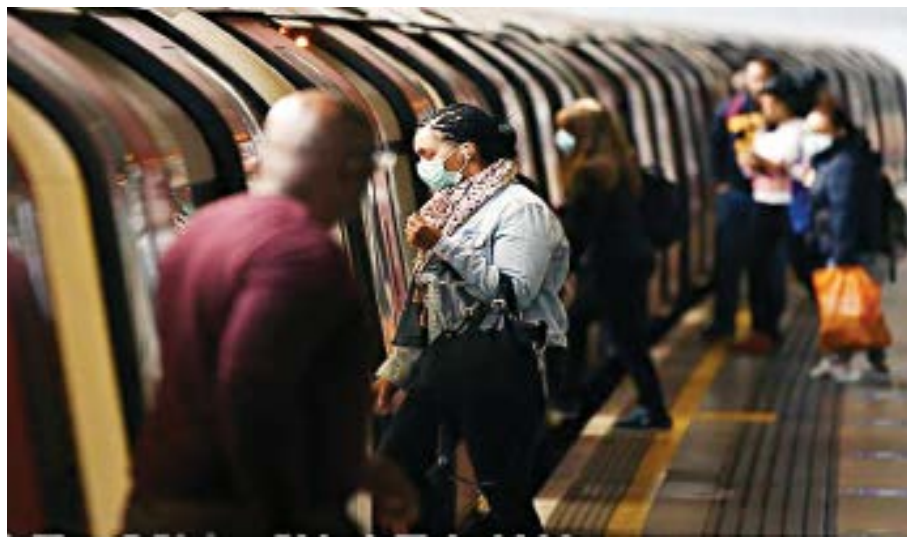
Commuters wearing protective equipment travel in the morning rush hour on London Jubilee Line underground trains from Canning Town towards central London on May 13, 2020.

economic issues and health concerns, among other things. Bangladeshis in the United Kingdom live as extended families under one roof. In many cases, families live in cramped rooms of houses provided by the Councils. The living conditions of these houses including their sanitation facilities are not good. So the implications are varied: i) the issue of social distancing is neither possible, nor practised; ii) even when someone is infected, isolation becomes difficult.