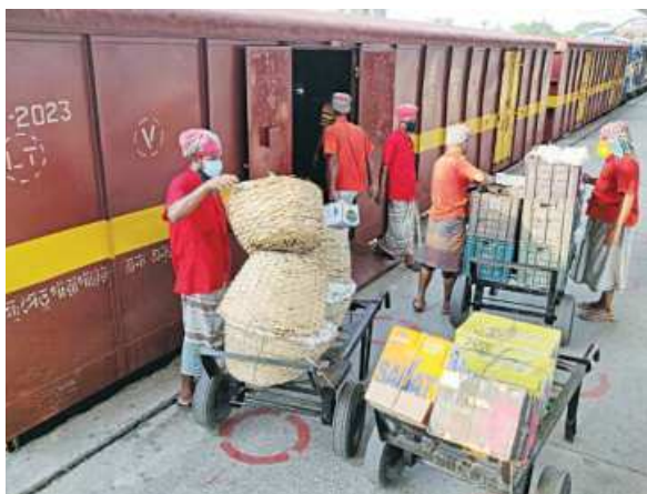
Workers load the summer fruit in a compartment of the train "Mango Special", which began its journey from Chapainawabganj to Dhaka yesterday.