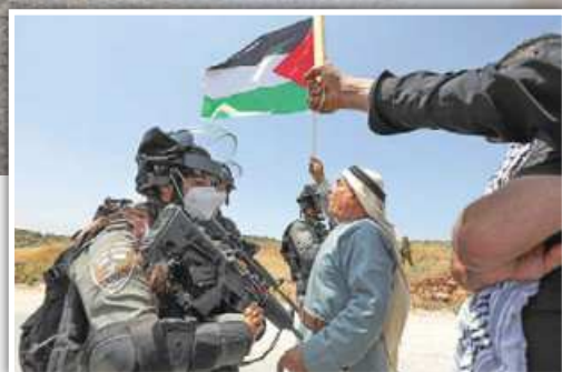
A young Palestinian woman runs from tear gas fired by Israeli forces and a Palestinian man wave a national flag on face of Israeli forces during a protest near the town of Tulkarm, West Bank, yesterday. Palestinians in the West Bank rallied to mark 53 years of Israeli occupation and protest against the Jewish state's plans to annex part of the territory.