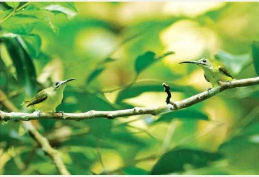
Little Spiderhunters, Satchori, Bangladesh.