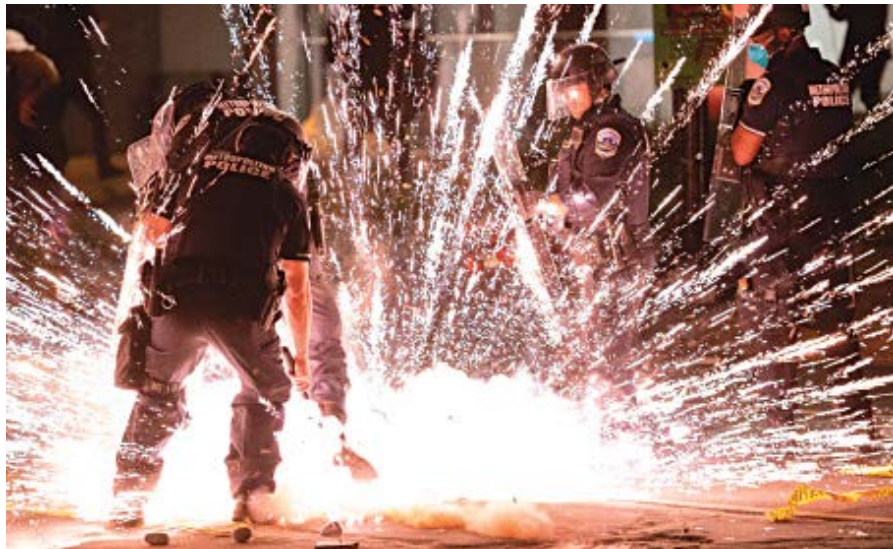
A firecracker thrown by protesters explodes under police fire during a protest over the death of George Floyd.