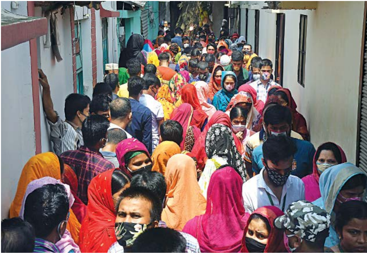
Workers of garment factories use a narrow alley to get to work at Nishchintapur of Ashulia on the outskirts of the capital yesterday. As the country reopens after a long shutdown, social distancing seems to have gone out the window.