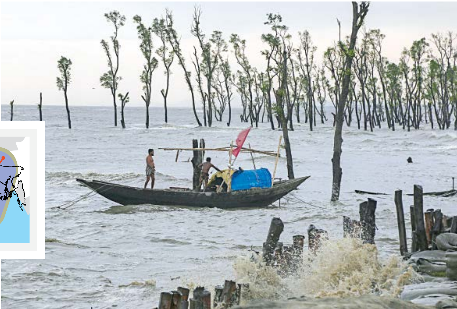
Two men trying to take their dinghy to safety as the sea begins to get rough near EPZ Beribandh in Chattogram. The photo was taken yesterday afternoon, hours before cyclone Amphan made landfall. The cyclone hit the coast around 5:00pm and moved inwards.