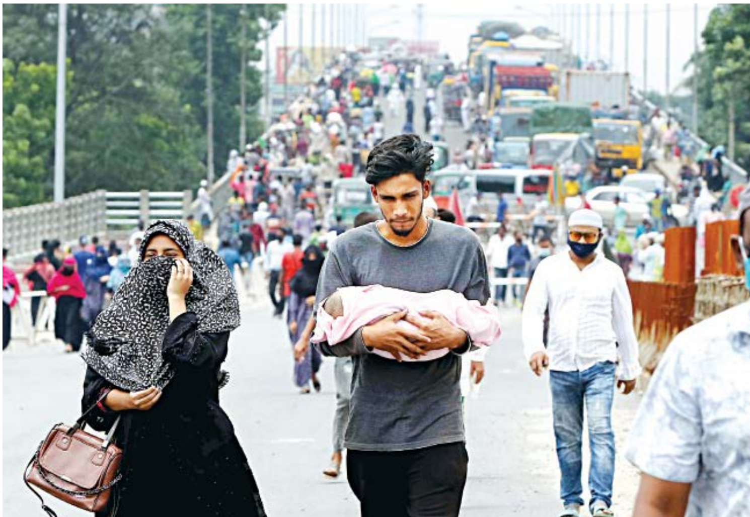
A man walking while holding his newborn after crossing the Postogola bridge. After police on Monday tightened checks in the area to prevent people from leaving or entering the capital, many have been walking across the bridge. The photo was taken yesterday afternoon.

NEW DEADLINE FOR SETTING UP SALES REGISTERS WOULD BE IN BUDGET SPEECH B1