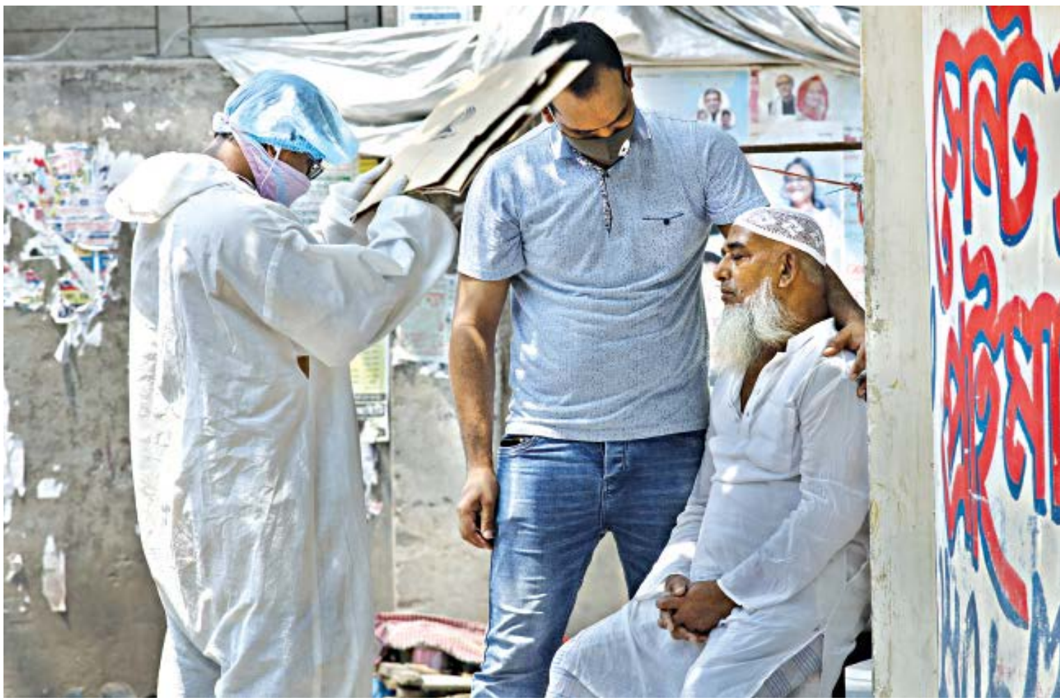
This elderly man has been suffering from fever, cold and breathing problems for over a week. Yesterday, he tried to get admitted to at least three hospitals, but all of them turned him away, suspecting him to be a Covid-19 patient. At one point, he felt severely ill and sat in chair on a pavement on Old Dhaka's Johnson Road. His son was seen comforting him when a medical representative in a PPE suit, who was passing the area, fanned him.

The circular said the government has decided to allow keeping shopping malls, all types of shops and other businesses open maintaining health guidelines during the general holidays considering Ramadan and Eid-ul-Fitr. "Shops will be allowed to remain open to do business on a limited scale. But all have to maintain distancing and follow health guidelines during buying and selling. Large shopping malls will have to make arrangements for washing hands at their entrances and disinfecting vehicles entering the malls," it added. The two circulars were published hours after Prime Minister Sheikh Hasina said