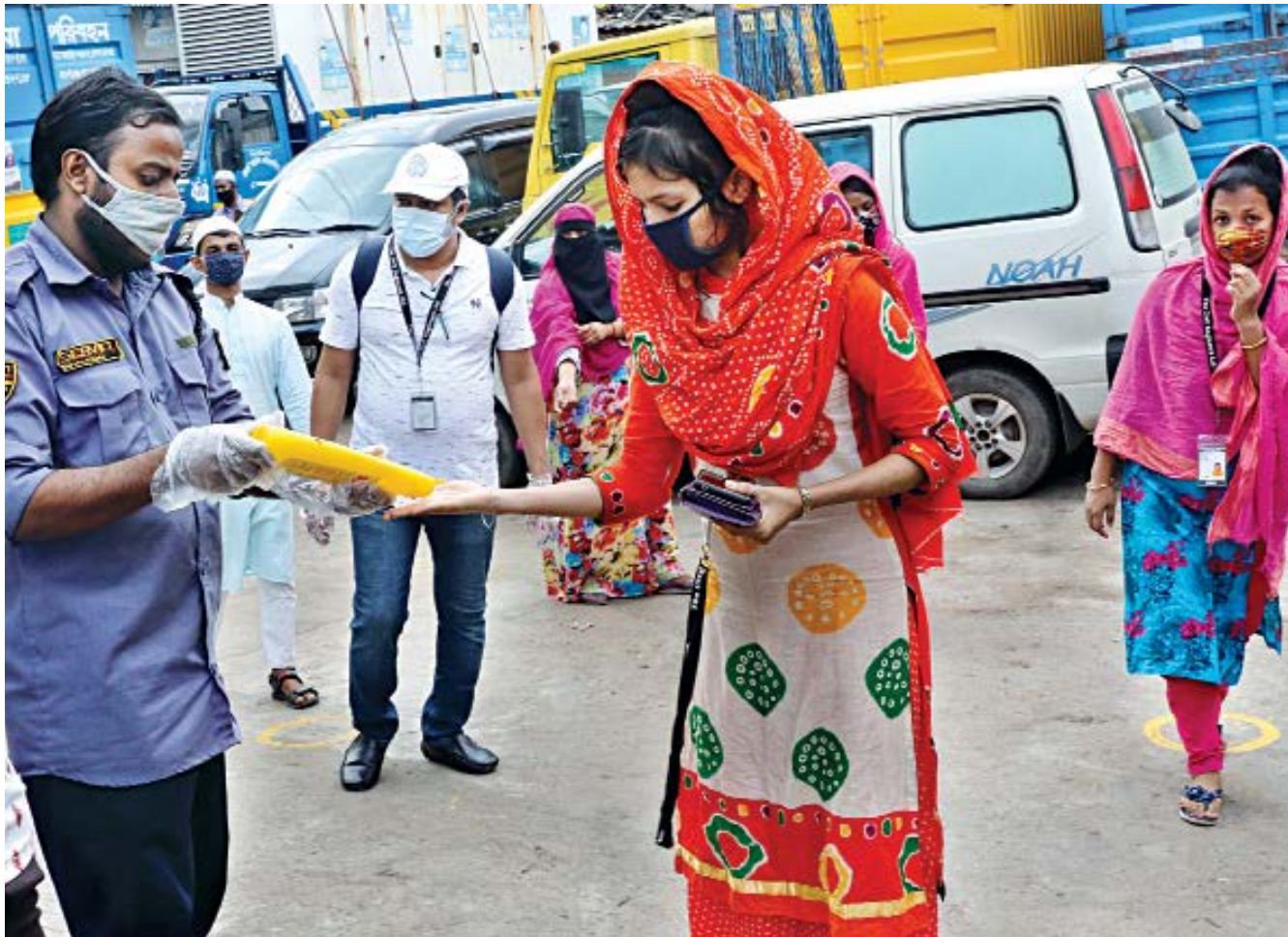
A garment worker takes hand sanitiser from the gatekeeper in front of a factory that reopened in the capital's Tejgaon industrial area with part of its workforce yesterday. Employees of the factory formed a queue maintaining safe distance among each other at the entrance.