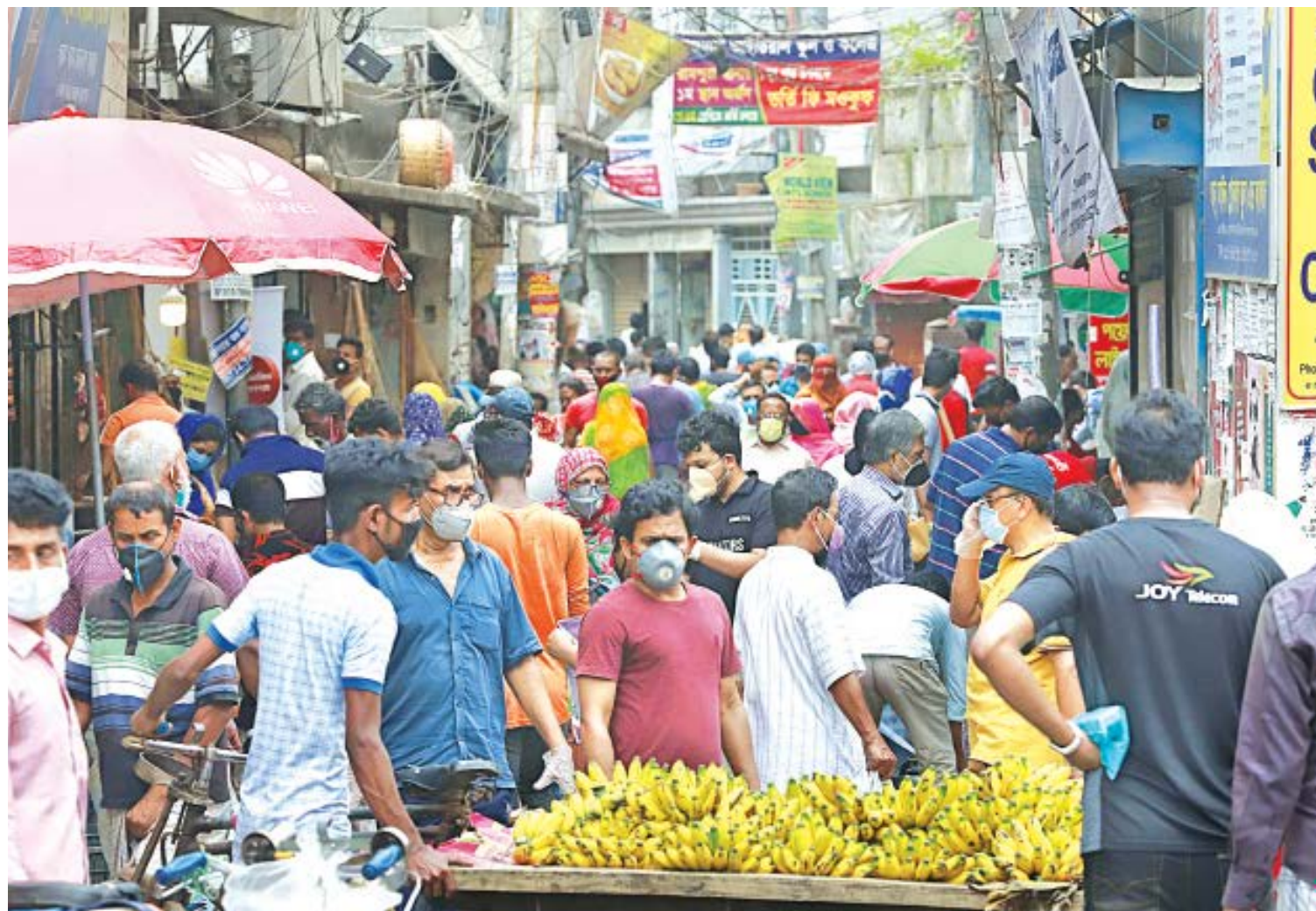
Crowds of people buying perishable goods from vendors near DIT Road in the capital's Rampura despite the risks of contracting and spreading coronavirus. Most of the people are wearing masks but maintaining social distancing is a far cry in such a setting. The photo was taken yesterday.