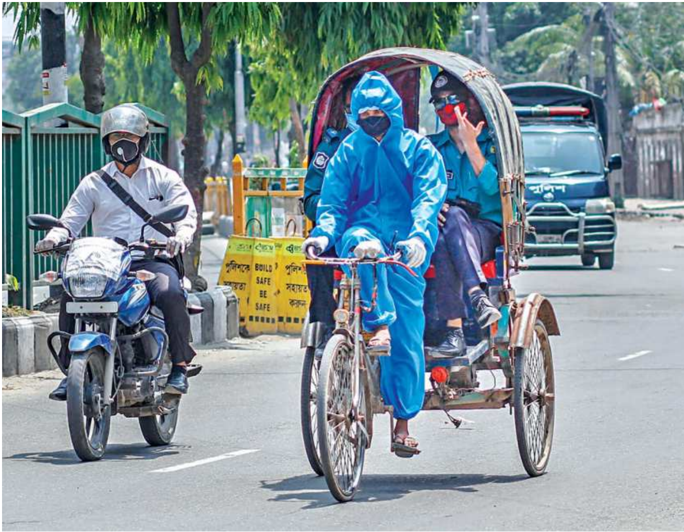
A rickshaw-puller, wrapped in a PPE-like dress, transporting two police officials in the capital's Fakirapul who appear to be a lot less cautious than the former. Like the duo, many people roam around the streets of Dhaka disregarding all government directives on social distancing.