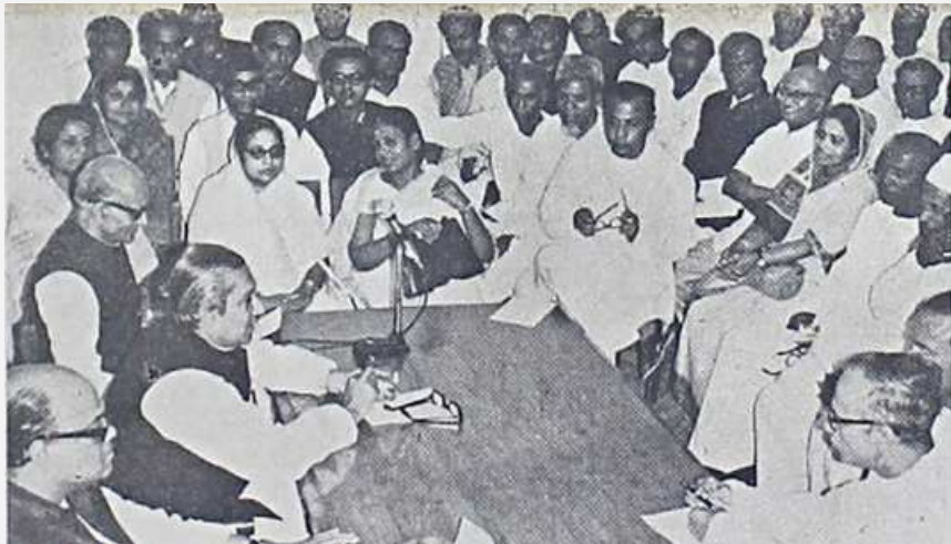
Bangabandhu addressing the members of the Awami League parliamentary party on April 9, 1972.