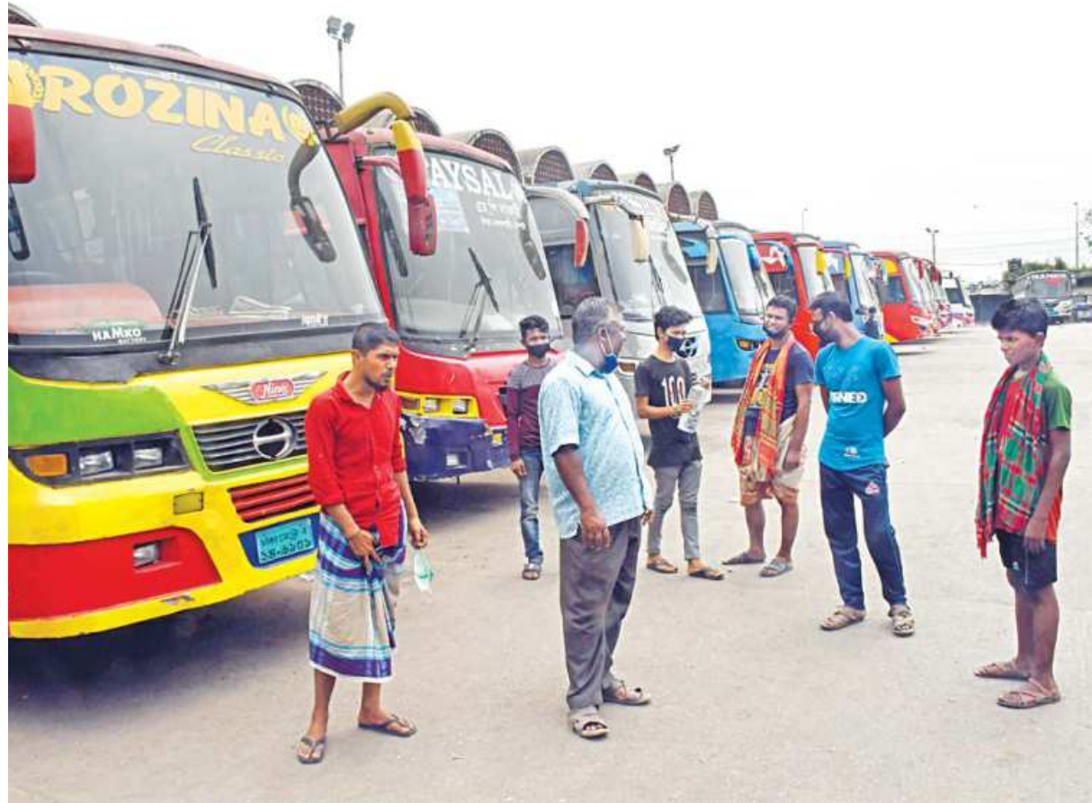
Transport workers passing an idle time as the government has imposed a countrywide shutdown to contain the spread of coronavirus. The photo was taken at Gabtoli Bus Terminal, one of the busiest terminals in the country.