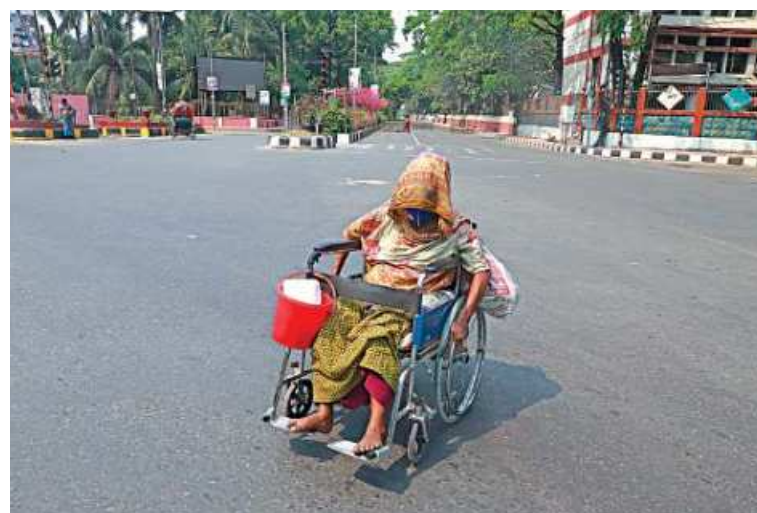
This woman, who lives near the High Court area, had to travel to Kakrail on her wheelchair to get some food assistance. The photo was taken in front of Matsya Bhaban on Thursday.

Persons with disabilities find it hard to avail relief, draw authorities' attention for special arrangements