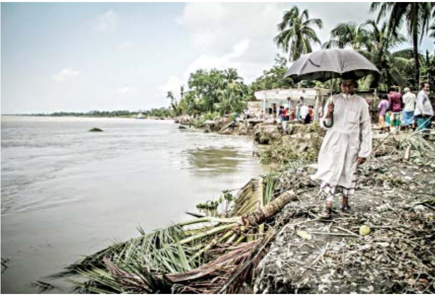
A man walks along a bank of the Padma River in Dohar, an area on the outskirts of Dhaka, on August 12, 2016.

So, what is the implication of such delays? Indeed, this is a waste of valuable time, money, and expertise. But, most importantly, a policy or a legal instrument loses its relevance due to these delays. It also misses the opportunity to make conservation effective. We have seen this in the case of the PA Rule and the ECA Rule, for example. If passed earlier, the PA Rule could result in better institutionalised co-management of the protected areas