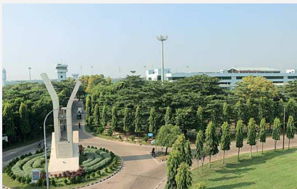
Shah Amanat International Airport, Chattogram.