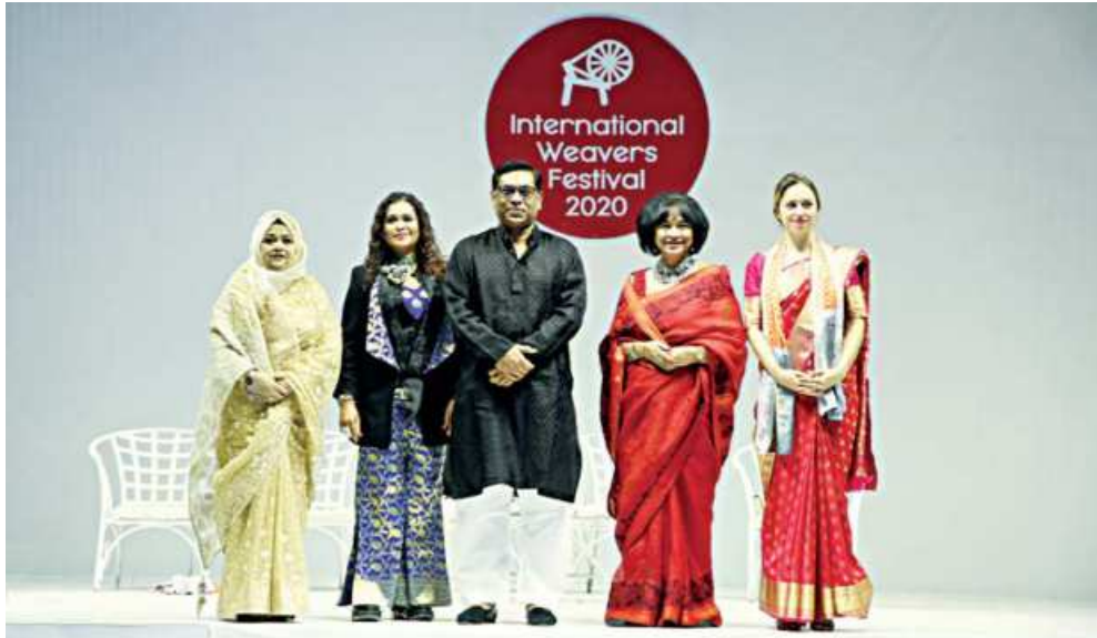
Esteemed guests and organisers at IWF 2020.

To promote local weavers and artists, the IWF 2020, under the theme, ‘Artists’ Impressions of Bangladesh’ included a fashion show, featuring fusion attires, which were made from Bangladeshi khadi, silk, cotton, muslin, Mirpur benarasi and jamdani.