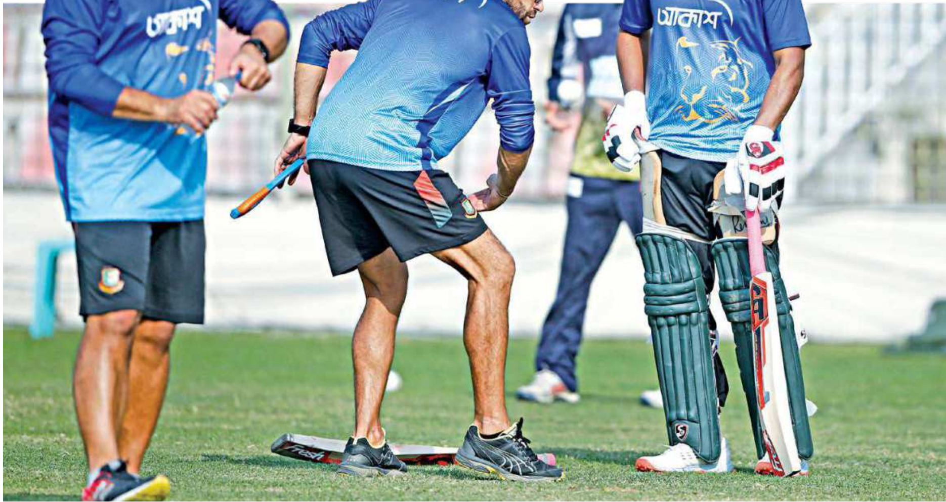
Under the watchful eyes of Bangladesh head coach Russell Domingo (L), may be batting consultant Neil McKenzie was explaining the fine adjustments that the star opener Tamim Iqbal (R) requires to convert his starts to big ones in Tigers' second ODI against Zimbabwe in Sylhet today and also in upcoming matches.