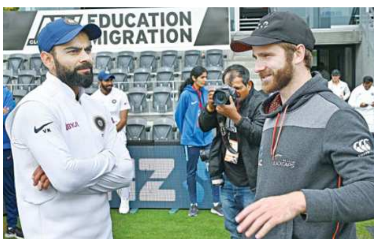
India captain Virat Kohli (L) talks to his New Zealand counterpart Kane Williamson after the hosts won the second Test yesterday.

performance". But it left India sparring with a journalist, who was captain Virat Kohli frustrated and caught making a foul-mouthed