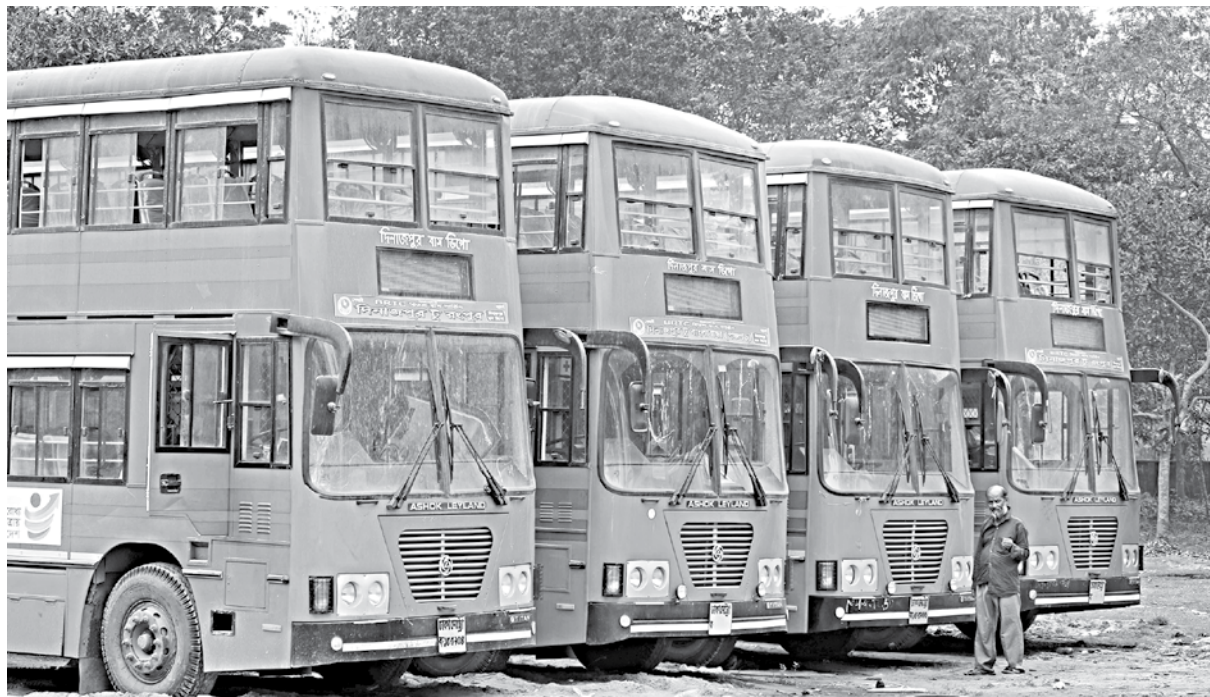
These four double-decker buses of Bangladesh Road Transport Corporation (BRTC) are kept at Dinajpur depot for long. Service of the state-owned organisation has remained suspended for the last six months due to objections from transport owners and workers of local private bus companies.

he usually makes a profit between Tk 16,000 and 18,000 from selling 7,000 to 8,000 stumps each month, Faruk also said. Nazim Matobbar, a worker who has been working at the factory for three years, said they are paid Tk 2.25 for each stump and he can make 270 to 300 stumps a day. Buyers from different districts including Dhaka, Bogura, Rangpur and Sirajganj arrive at the factory every day to collect stumps at whole sale prices. Winter is the busiest time when they start work at 8:00 in the morning and close at 12:00 midnight. But during the wet season, the workers have no work to do as there is usually no order for stumps that time, he added. Fakir Belayat Hossain, chairman of Kanaipur Union Parishad, said, "Faruk's stumps are really high in quality. It's a good thing for the neighbourhood that six people are working at his factory."