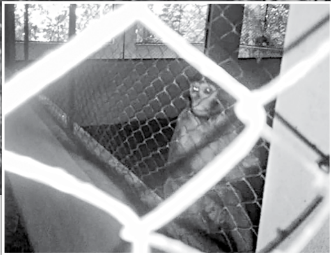
The premises of Wildlife Rescue Centre at Janakichhara of Lawachhara National Park in Moulvibazar's Kamalganj upazila gives the look of a derelict spot as the set-up is running without any regular staff. Inset, a monkey currently undergoing treatment at the centre.