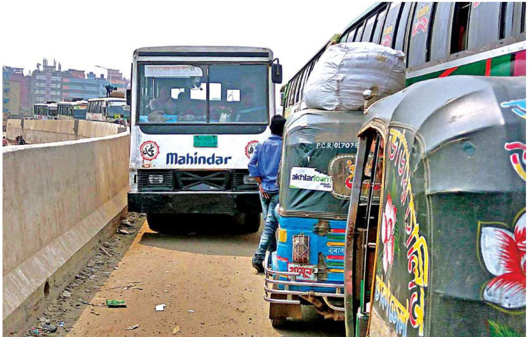
Buses going against traffic on the newly-built one-way overpass on Dhaka-Mawa highway in the capital's Postogola area. On-duty traffic policemen on the bridge were not doing anything to stop them. Such violations of road rules pose risks of accidents, putting lives at risk. The photo was taken around noon yesterday.