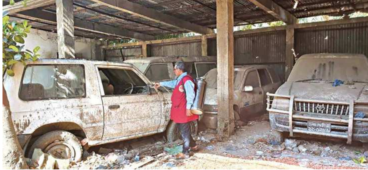
A worker of Dhaka North City Corporation sprays insecticide at an abandoned car park in Mirpur. DNCC yesterday inaugurated an initiative to take special anti-mosquito measures in five risk-prone wards.