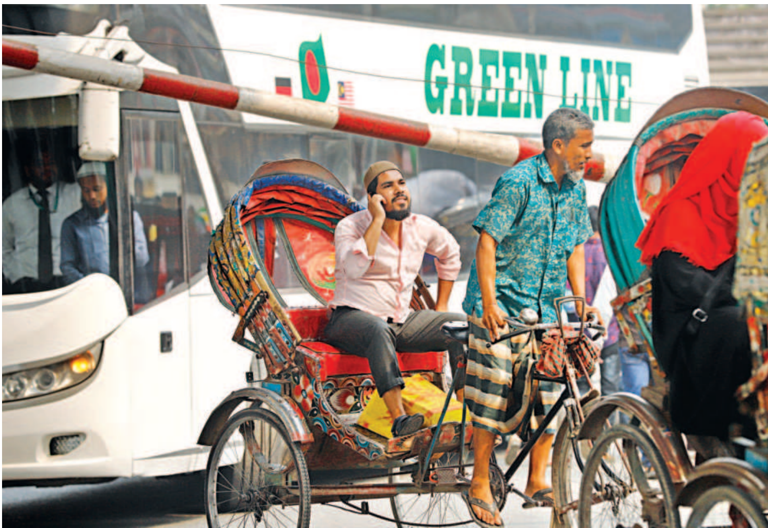
With a train approaching (not in the picture), a rickshaw carrying a passenger squeezes through the closing gate at the capital's Malibagh rail crossing, ignoring the risk of a possible accident. According to Buet's Accident Research Institute, at least 239 people were killed and 470 others injured at level crossings and adjacent areas in rail-related incidents last year. The photo was taken on Sunday.

Giving in to the pressure from transport associations, the government has waived the late fines for vehicle owners and drivers who failed to update their documents on time. The vehicle owners and drivers would enjoy the benefit till June 30, according to a circular of the road transport and bridges ministry issued yesterday. The order came into effect immediately. The notice said this was for the last time the government was going to grant such a waiver. The ministry asked Bangladesh Road Transport Authority (BRTA) to circulate the information among the transport owners. Under the traffic law, vehicle owners and drivers have to pay a certain amount of fine for failing to update the vehicle's fitness certificate, tax token, route permit and licence. Talking to The Daily Star, two BRTA officials said although the waiver would be applicable for all types of vehicles and drivers, commercial vehicles like bus, truck, and covered van and their drivers would actually be benefited by the order. SEE PAGE 10 COL 2