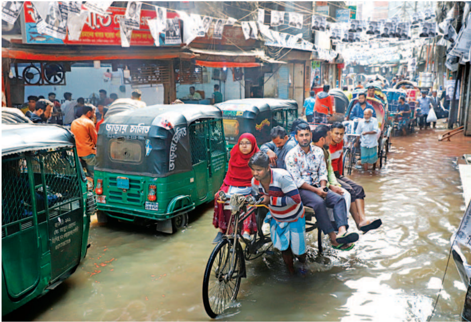
Vehicles cross old Dhaka's Kazi Alauddin Road inundated by water from leaked sewerage line. Locals said though the stinky water flooded the road two days ago, the authorities did nothing to fix the line until yesterday afternoon when this photo was taken.

India's Hindu nationalist ruling party yesterday elevated a veteran lawmaker and long-time associate of Prime Minister Narendra Modi to become its president ahead of a string of state elections. Jagat Prakash Nadda, who rose through the ranks after cutting his teeth as a student leader in the 1970s, will become the new president of the Bharatiya Janata Party (BJP), replacing Amit Shah, currently India's Home Minister. Nadda was elected unopposed, the party said. Led by Modi and Shah, the BJP returned to power, winning in a general election in 2019 by a landslide majority, but the party has failed to keep its hold on a number of key Indian states amid growing criticism over some of its SEE PAGE 10 COL 6