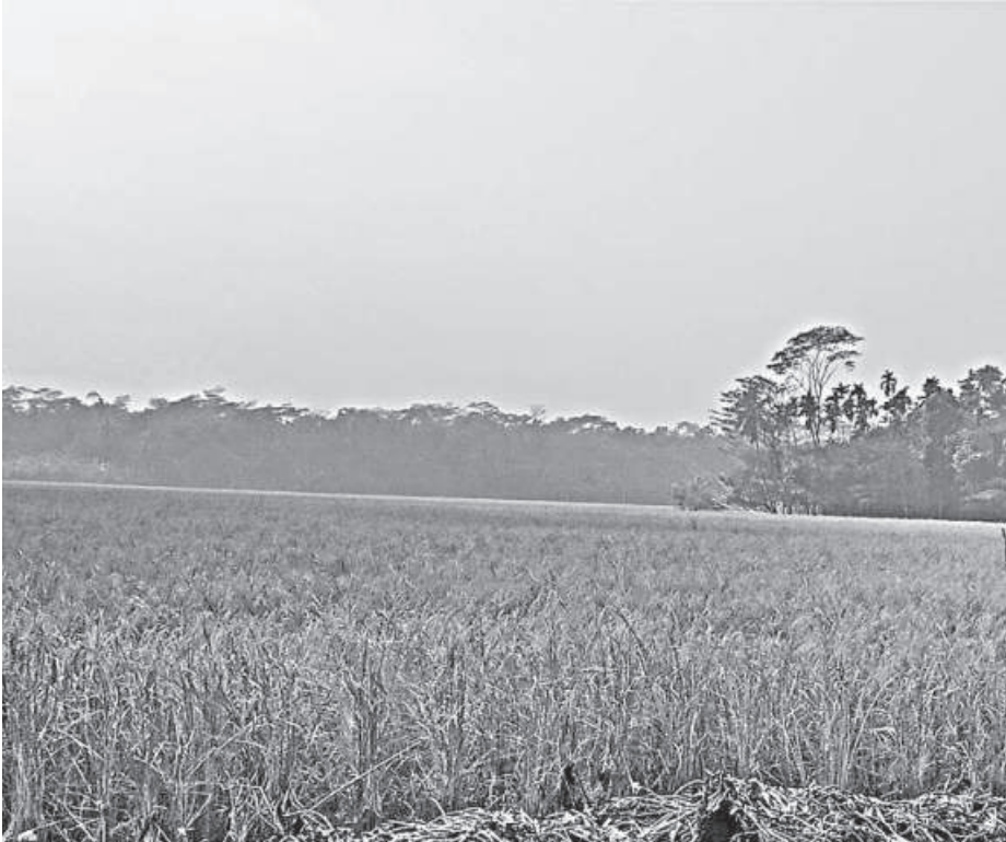
A field with ripe Aman paddy at Jhatokathi village in Pirojpur Sadar upazila.