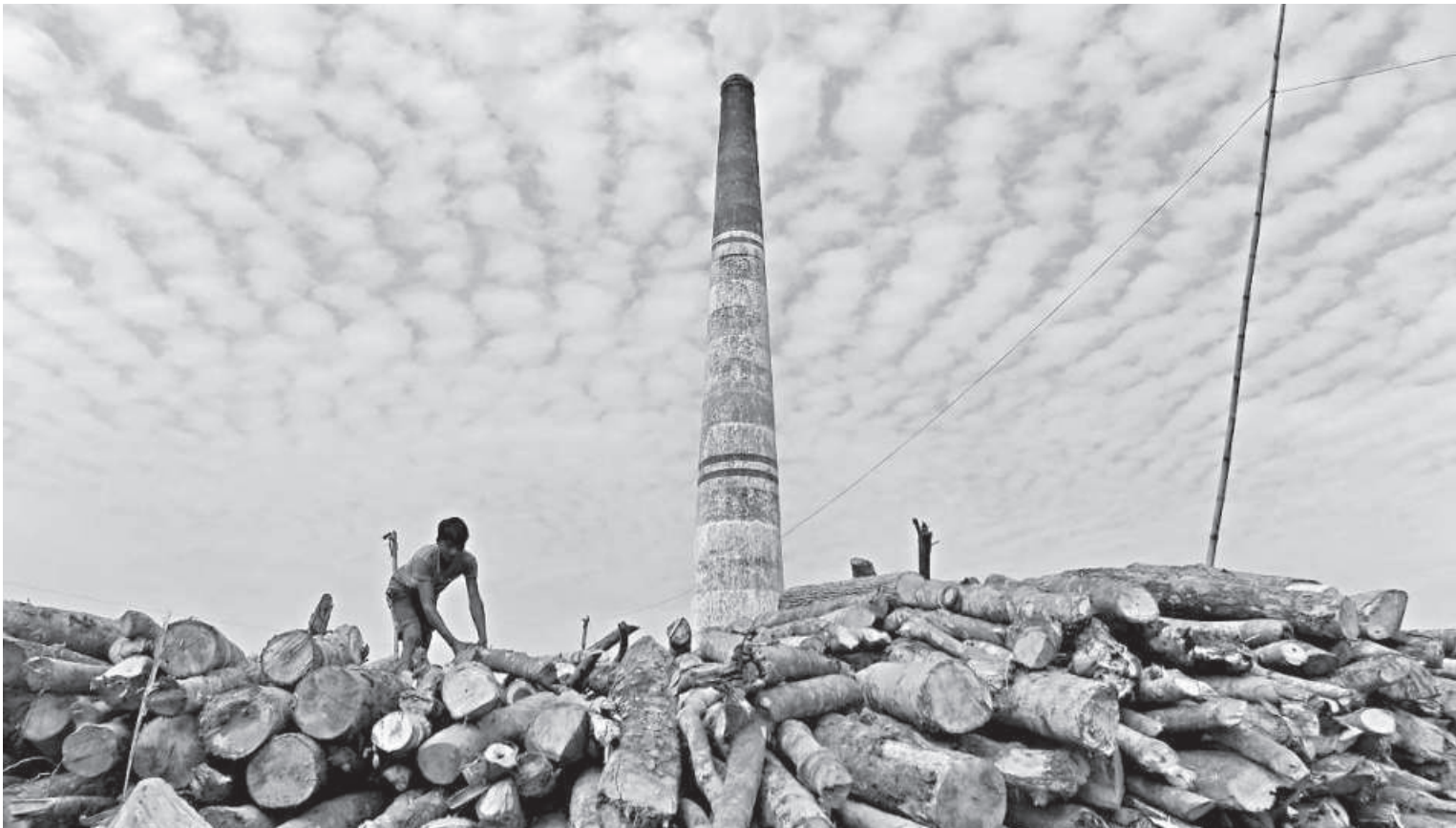
Logs piled up at an illegal brick kiln in Bandarban’s Lama upazila.