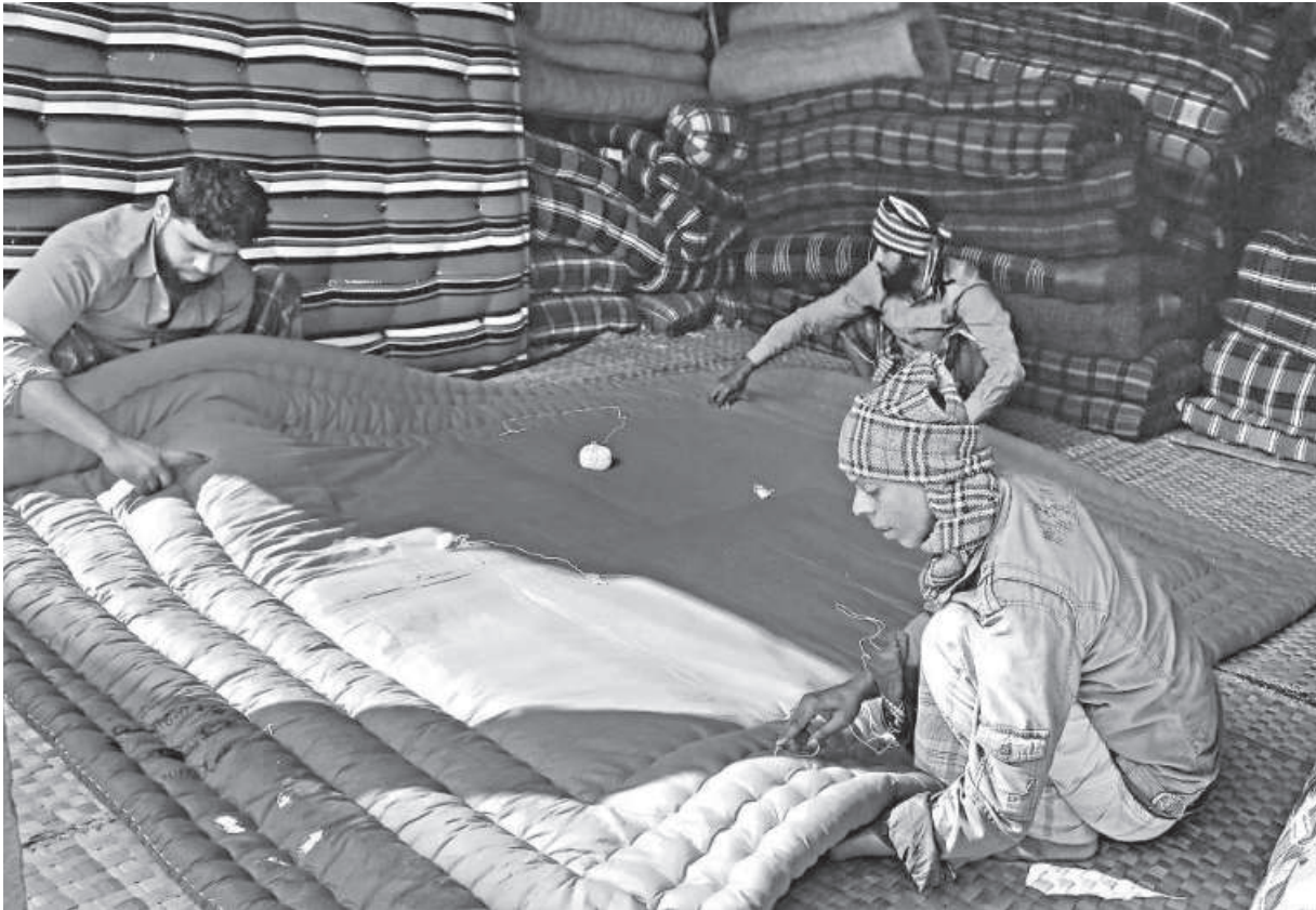
Quilt makers pass a busy time at a shop in Pirojpur town as demand of the item sees a sharp rise, especially at the onset of the cold wave during the ongoing winter.