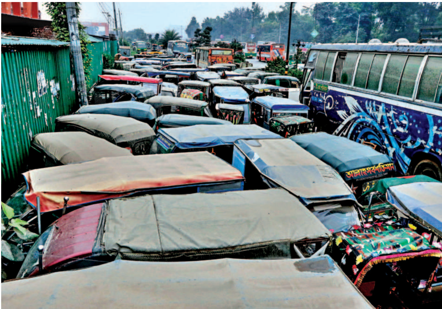
Impounded vehicles occupy an entire road parallel to the street near the capital's Airport intersection, blocking traffic movement. Police have been keeping such vehicles there for nearly a year. The photo was taken on Wednesday.