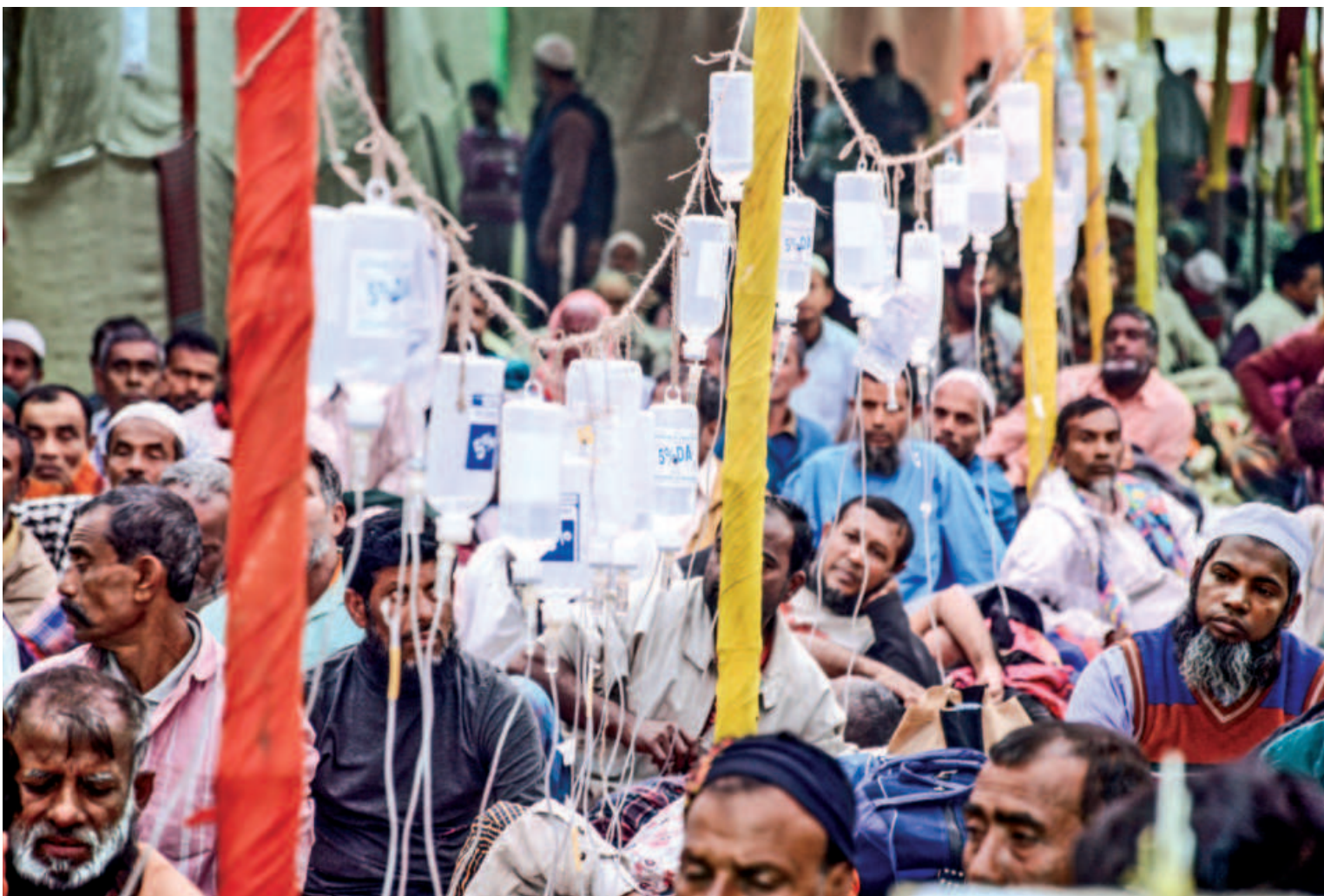
Demonstrating jute mill workers being administered saline in front of Platinum Jute Mills gate in Khulna yesterday, the fifth consecutive day of their hunger strike to press home their 11-point demand, including timely payment of wages. Their leaders called off the strike last night following assurance from the government.