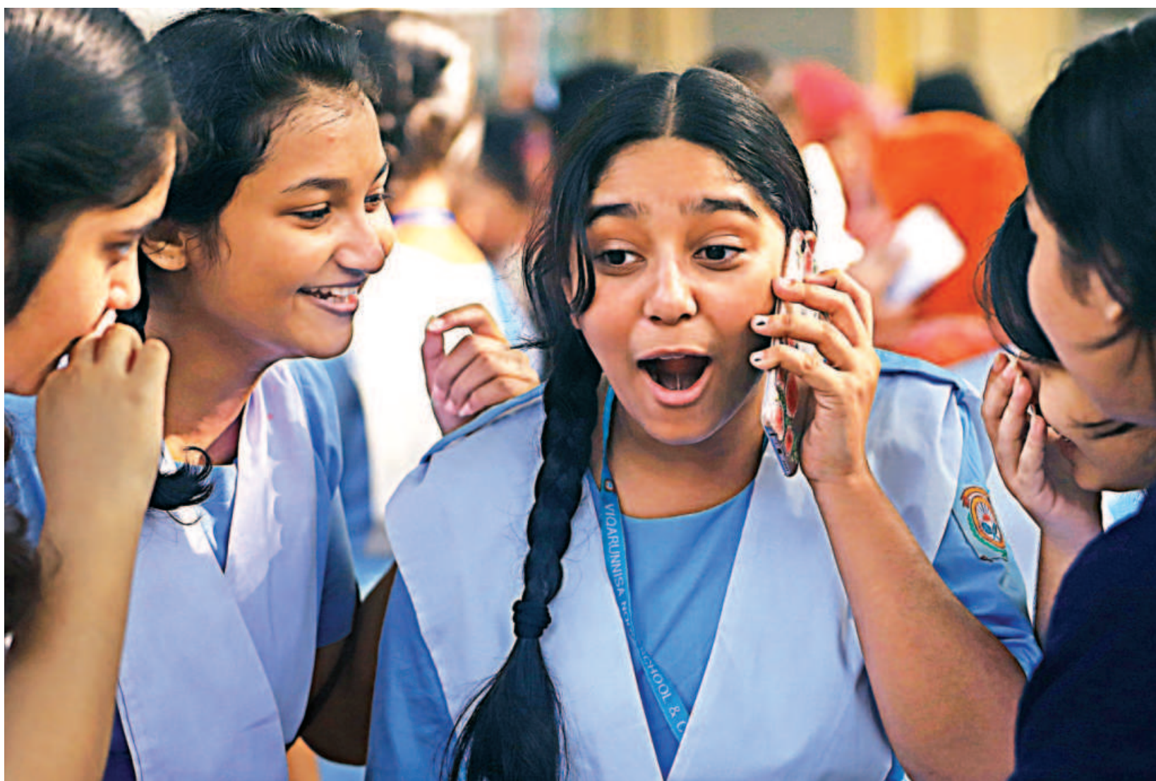
Surrounded by her smiling friends, an excited student at the Viqarunnisa Noon School & College calls her other friends to tell them how well she did in her JSC exams yesterday.

The workers had postponed their protest programme on December 14 following assurance from Monnujan Sufian, state minister for labour and employment, that their demands would be met.