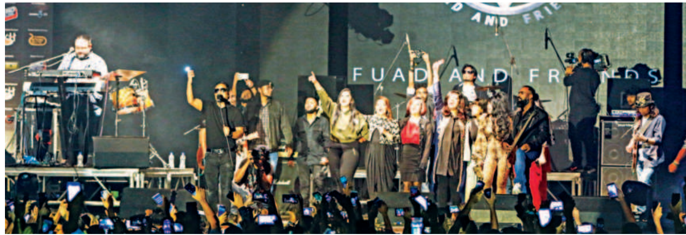
'Fuad live in Dhaka' celebrated the best in Bangladeshi pop music.