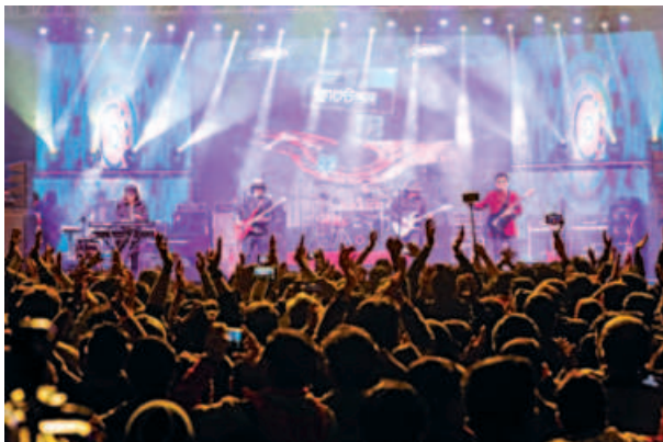
Miles at their 40 year celebration concert.