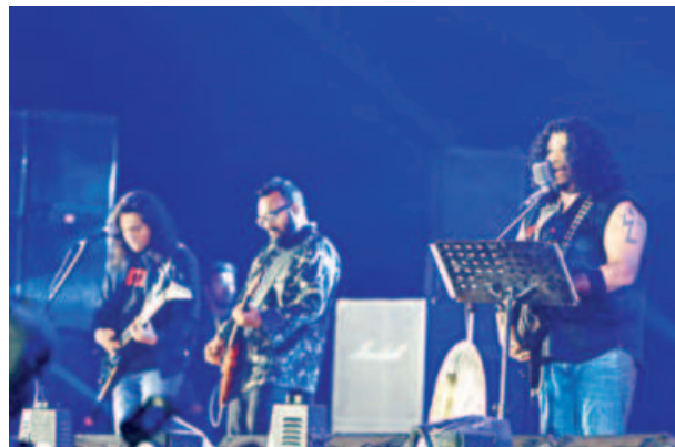
'20 Years of Artcellism' was a runaway success.