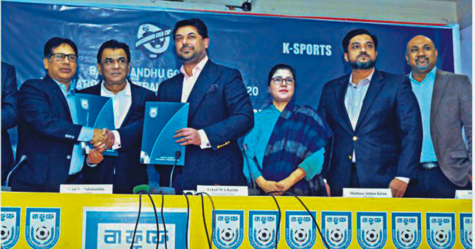
FF and K-Sports high-ups pose for a photograph after signing an agreement regarding Bangabandhu Gold Cup international football tournament at the BFF house yesterday.

Arsenal showed just how much work Arteta has to do to steer the Gunners back to respectability in his first managerial role. After coming from behind to rescue a 1-1 draw at Bournemouth in his first match on Thursday, Arteta would have been encouraged by their bright start -- but not the woeful meltdown that leaves Arsenal with only one win in their last 15 games in all competitions. Arsenal, 12 points adrift of the top four, have lost four consecutive home fixtures in all competitions for the first time in 60 years. While Arteta held his head in despair after Abraham's winner, Frank Lampard's wild celebration showed Chelsea's need for the win after a difficult period of their own. Fourth placed Chelsea had lost five of their last seven league games, but a second successive away win -- following their recent impressive success at Tottenham -- moves them four points clear of fifth placed Manchester United.