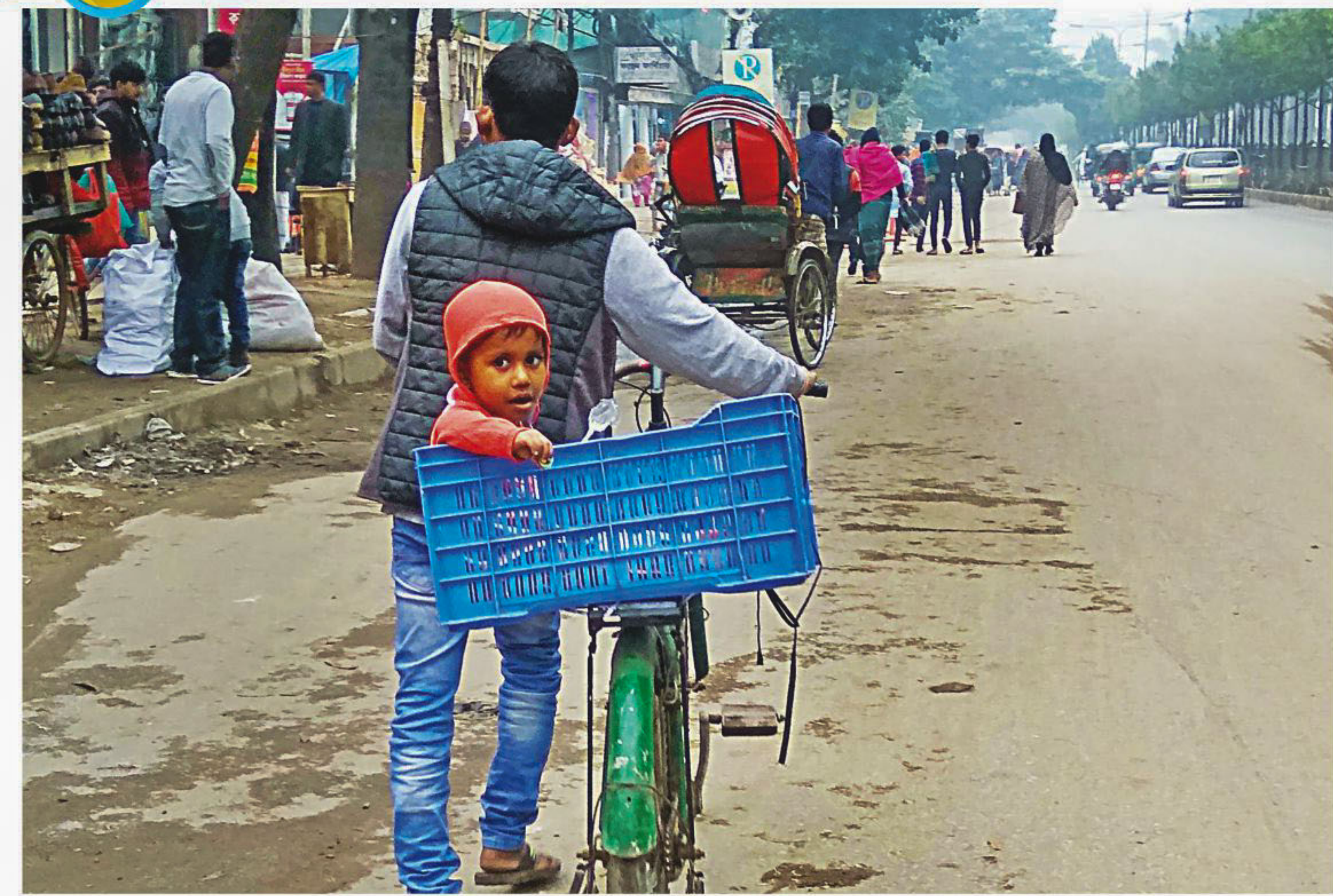
A little boy travels through Dhaka's Panthapath on a crate attached to a family member's bicycle -- an ideal winter morning commute, indeed. The photo was taken recently.