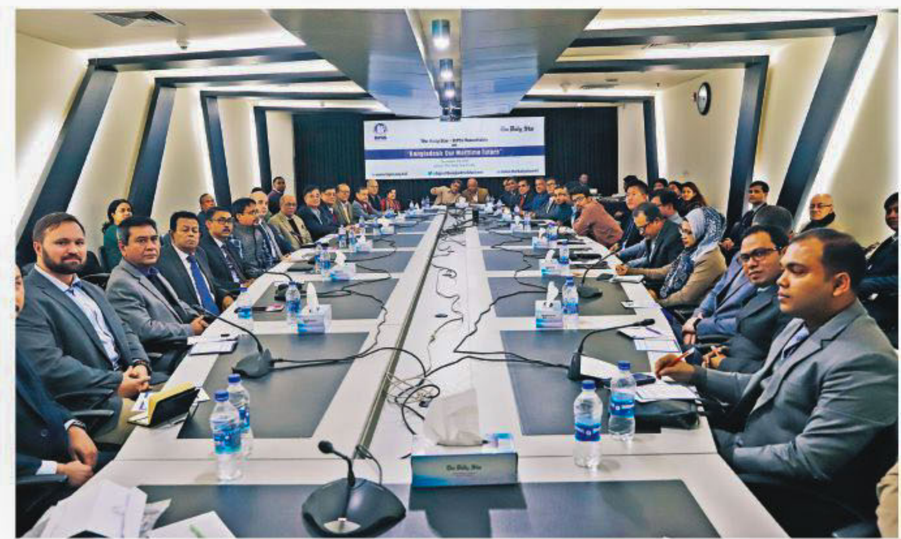
Participants of the roundtable at the The Daily Star Centre yesterday.

Experts call for comprehensive maritime policy