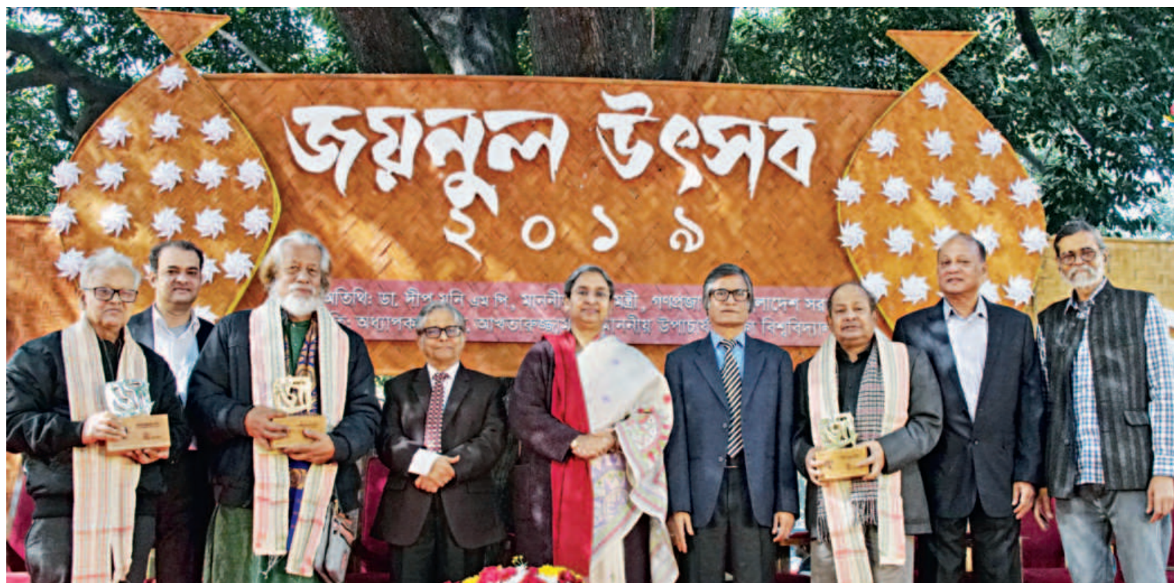
The guests, awardees and organisers at the festival.

Group Art Exhibition Title: Breaking Ground: Modern Art in Transition Venue: Subir Choudhury Exhibition Hall, Bengal Shilpalay, Dhanmondi Date: Dec 17 – Feb 15 Time: 1 pm – 8 pm (Except Sundays)