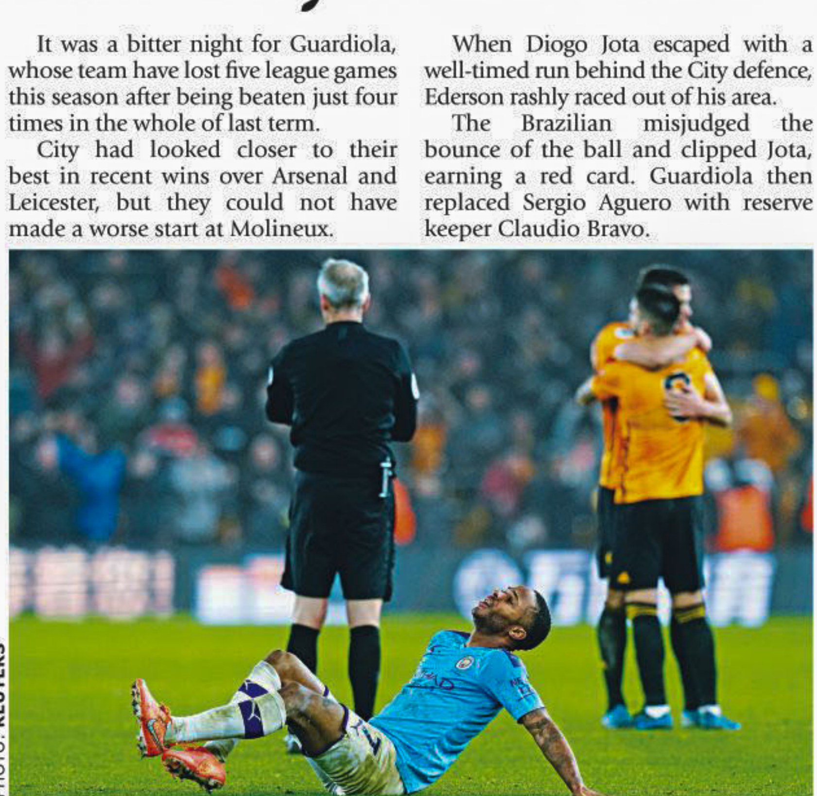
Manchester City forward Raheem Sterling is left dejected following a 3-2 loss to Wolverhampton Wanderers in the English Premier league on Friday.

Premier League Manchester City's faint hopes of retaining the Premier League title were left in tatters as they blew a two-goal lead and had Ederson sent in a dramatic 3-2 defeat at Wolves on Friday. Pep Guardiola's side recovered from Ederson's 12th minute dismissal to take control thanks to Raheem Sterling's double either side of half-time. But City's fatigued stars were unable to go the distance as Adama Traore's goal started a thrilling Wolves fightback. Raul Jimenez equalised with eight minutes to go and Matt Doherty hit the winner to send Molineux wild in the 89th minute. Third-placed City trail runaway leaders Liverpool by 14 points and Jurgen Klopp's red-hot team have a game in hand, making it hard to imagine the champions getting their hands on the trophy for a third successive season. Wolves, flying high in fifth place, have contributed to City's downfall more than most and, after winning 2-0 at the Etihad Stadium in October, they celebrated a top-flight double over the Manchester club for the first time since 1960-61.