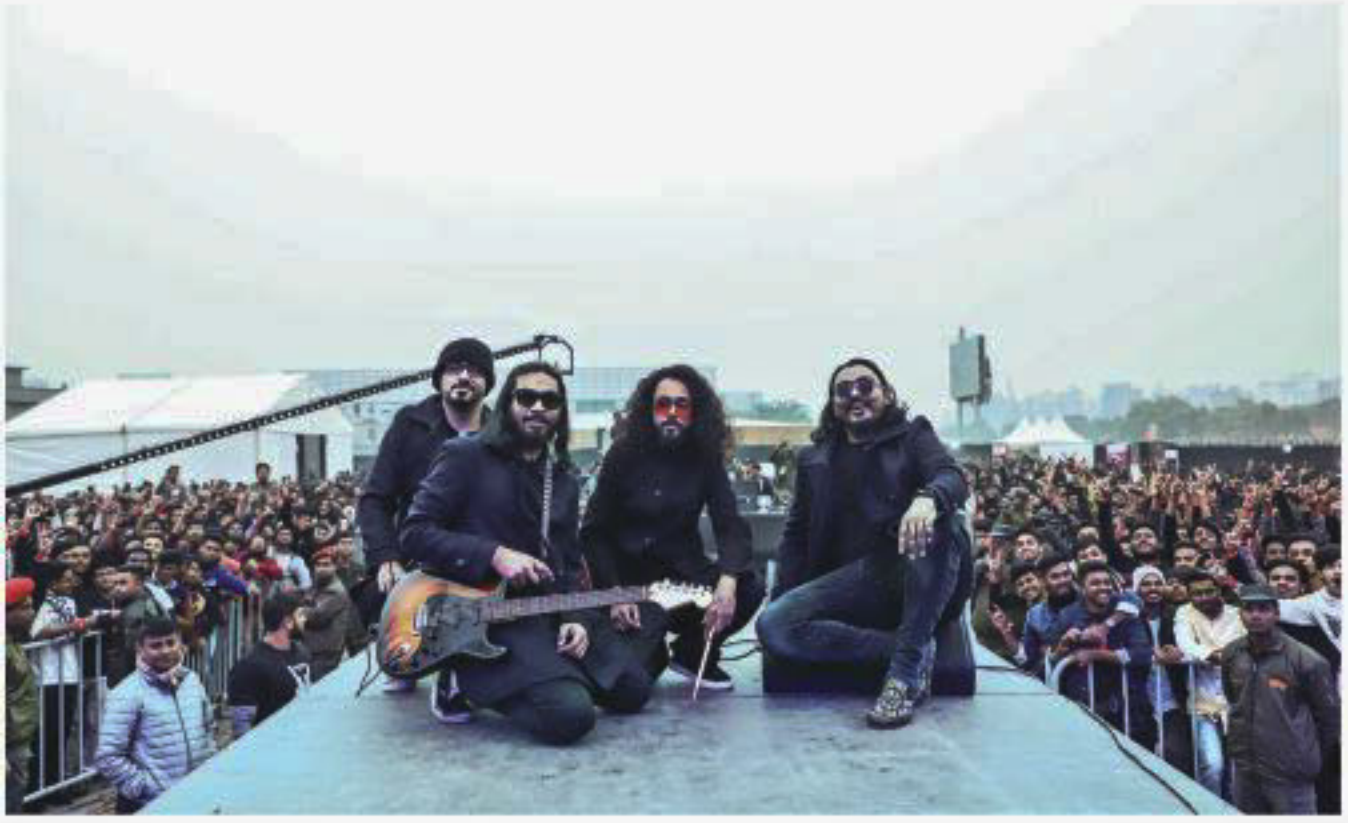
Owned literally owned the stage.