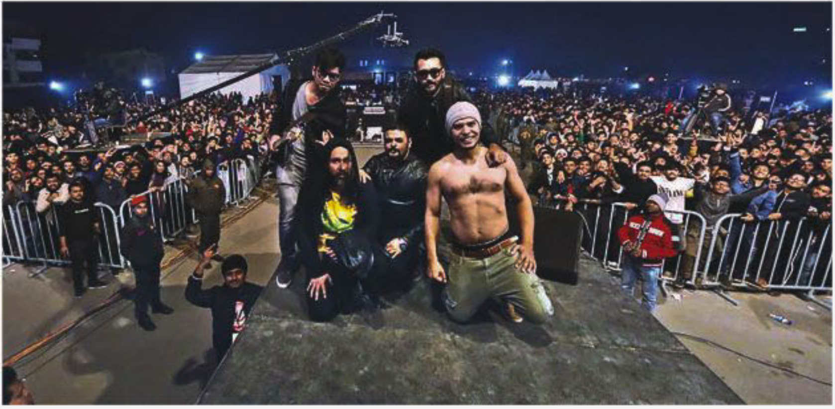
Arbovirus after their energetic act.