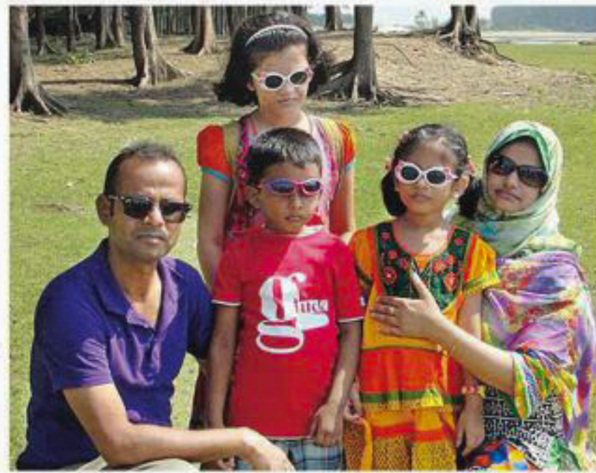
A family photo of the victims. The father and two daughters were killed in the accident.