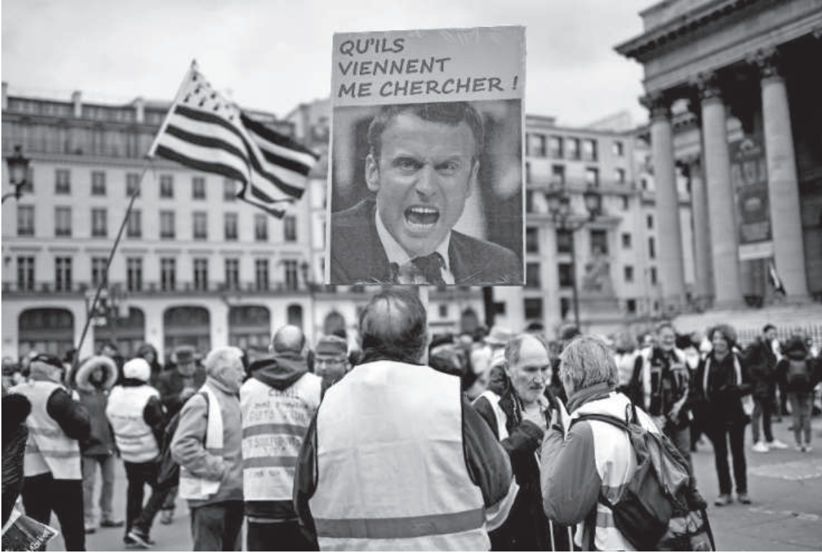
A protester holds a sign depicting French President and reading “Let them come and get me !” on the Place de la Bourse in Paris during a demonstration called by the “Gilets Jaunes” (Yellow Vests) movement yesterday, as part of a nationwide multi-sector strike against French government’s pensions overhaul.

“I demand justice,” she added. The couple was sent to jail via court yesterday evening, said the police official.