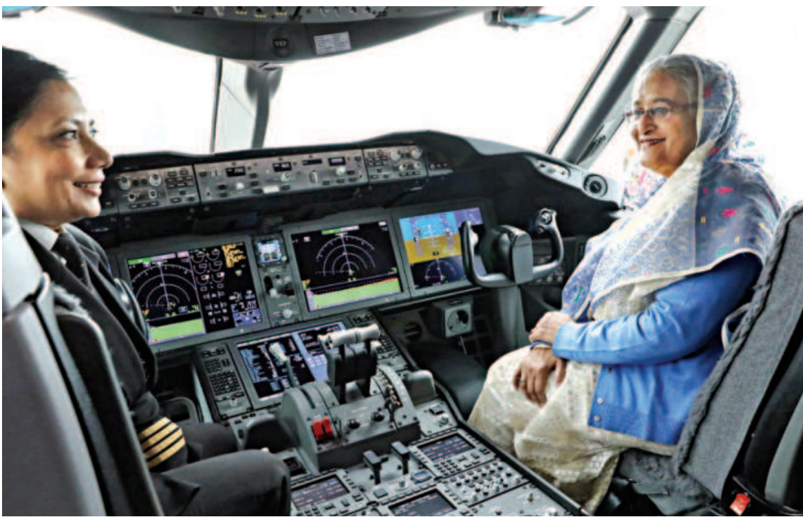
Prime Minister Sheikh Hasina sitting in the first officer's seat talks to a pilot in the cockpit of a brand-new Boeing 787-9 at Hazrat Shahjalal International Airport. The PM yesterday inaugurated two 787-9s bought for Biman.