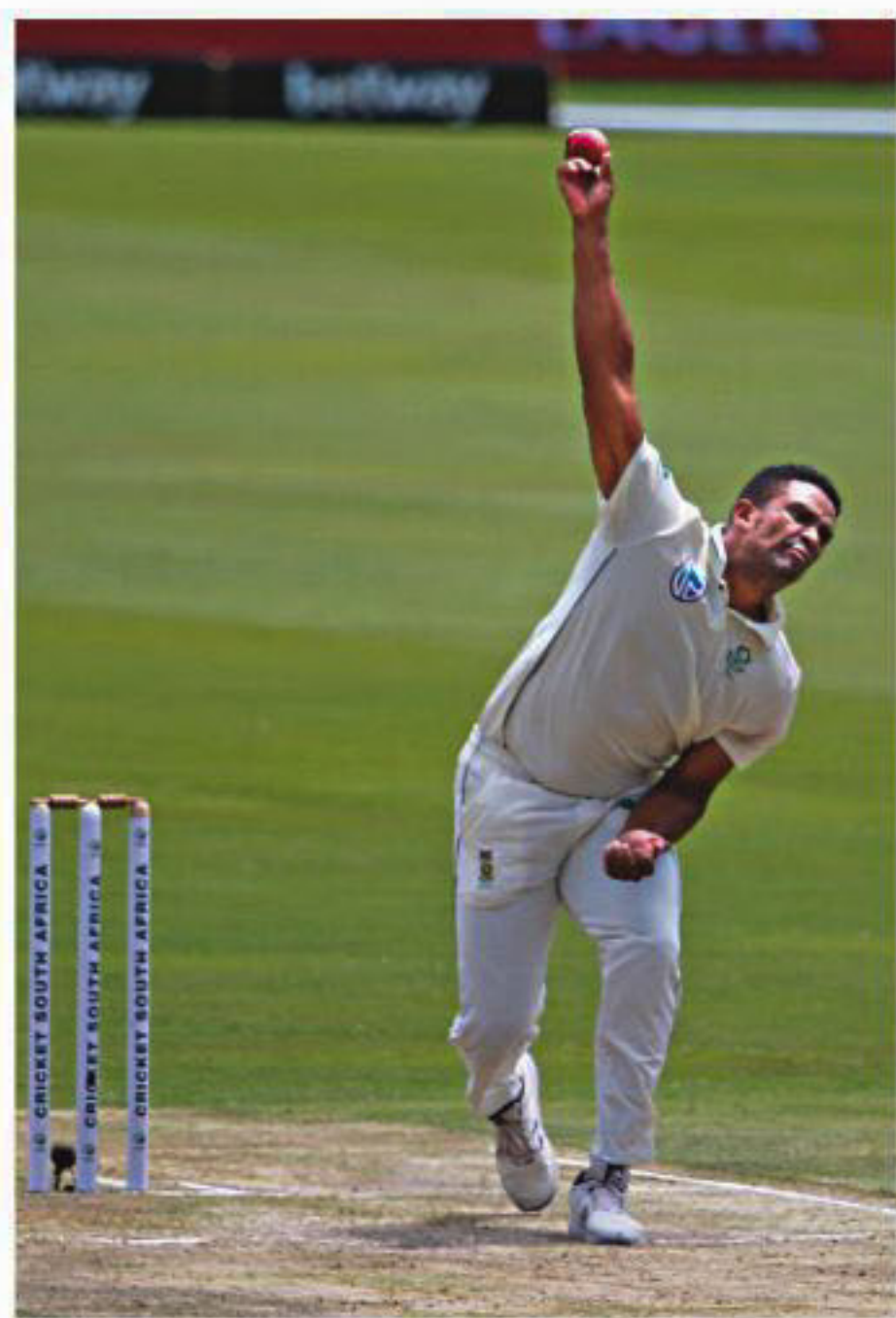
PHILANDER... 4 for 16

ENGLAND: First innings 181 all out (Denly 50, Root 29, Stokes 35; Rabada 3-68, Philander 4-16, Nortje 2-47)