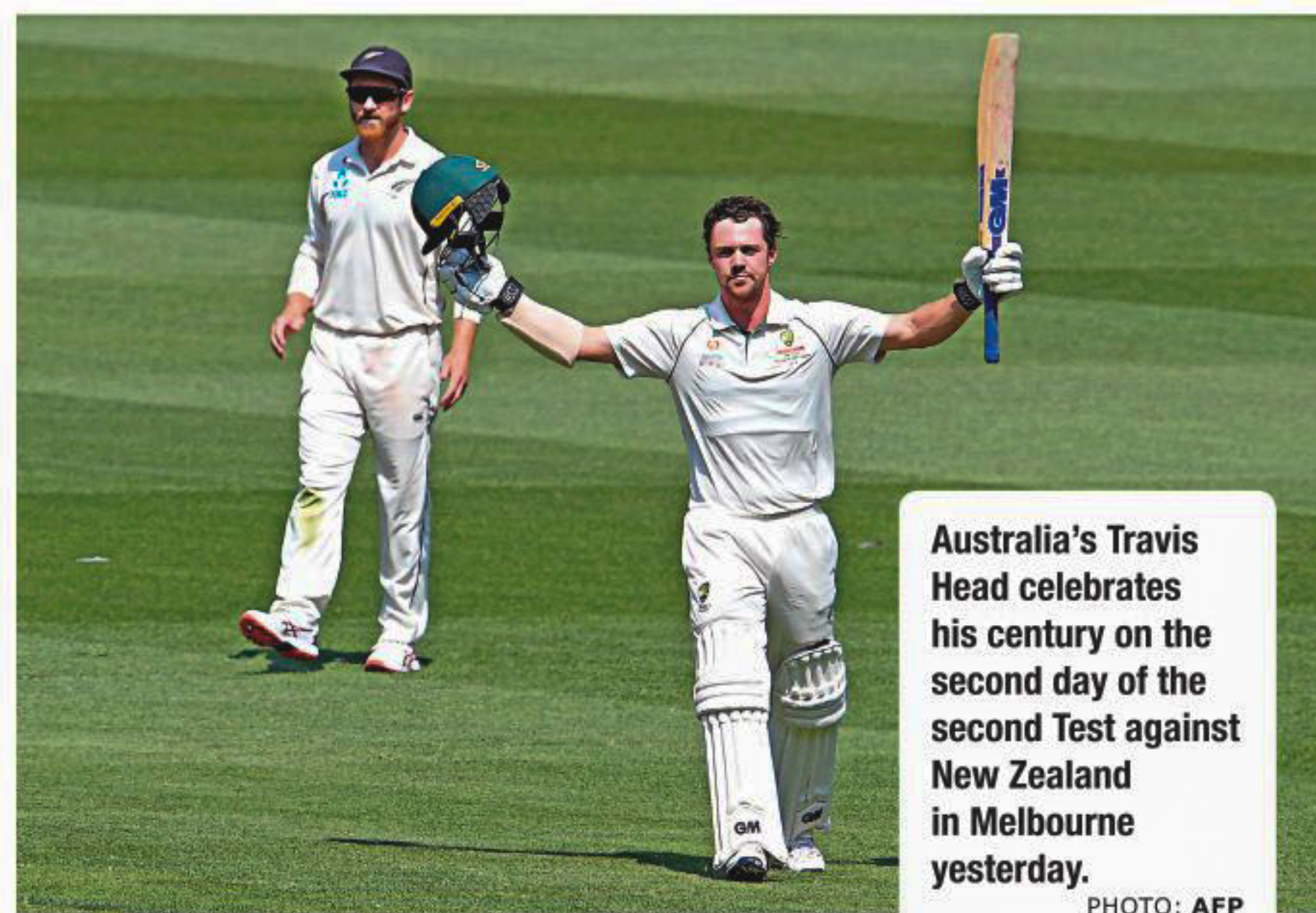
Australia's Travis Head celebrates his century on the second day of the second Test against New Zealand in Melbourne yesterday.

Rangpur missed out on Watson's considerable batting prowess yesterday as he was dismissed for just five. It will be interesting to see whether they continue with Watson until they lose three more matches or, if the past is a clue, they manage to win one.