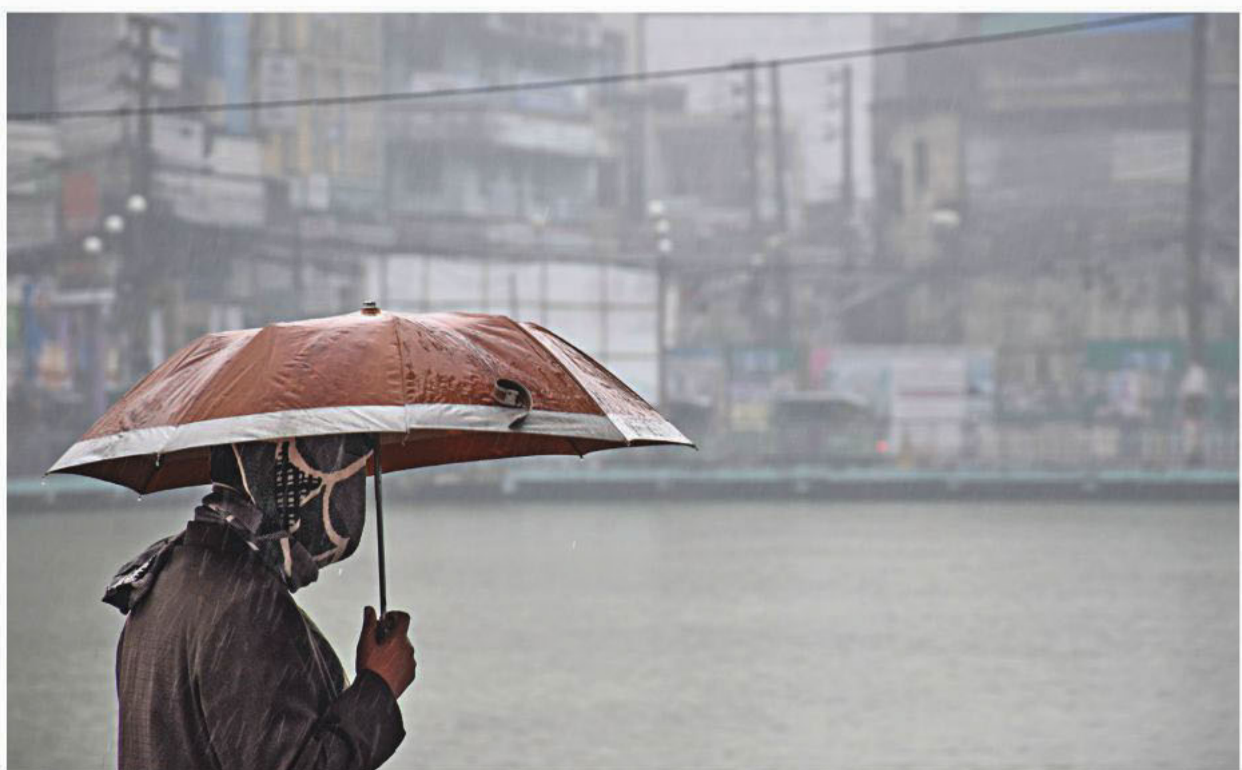
Weather in Barishal became chillier yesterday after a morning drizzle that continued till noon. Rain also added to winter woes. This photo was taken from Sadar Road in the city.