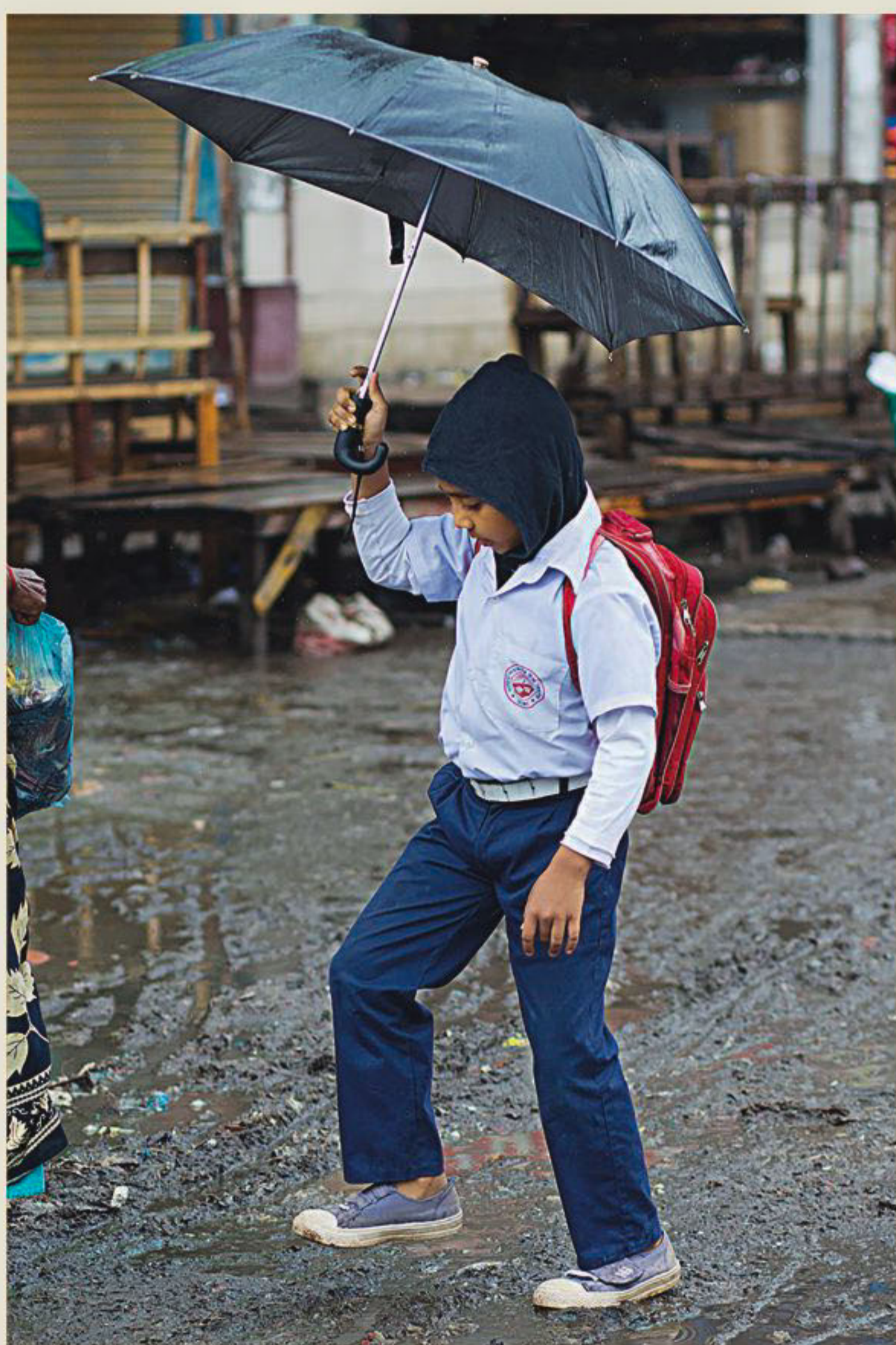
A Lighter Footstep.

That's how I learned about Ultralight Backpacking. The goal was to keep the weight of basics under ten pounds; to this you added food and water. I never quite reached that goal but came close by using items made of lightweight material. Some of it came down to money. Lightweight gear was almost always more costly. But there were also skills involved: how to wear a frameless backpack so your back is not in pain after miles of walking, how to seal the seams of a single-wall tent so you are not drenched in your sleep when that midnight shower arrived