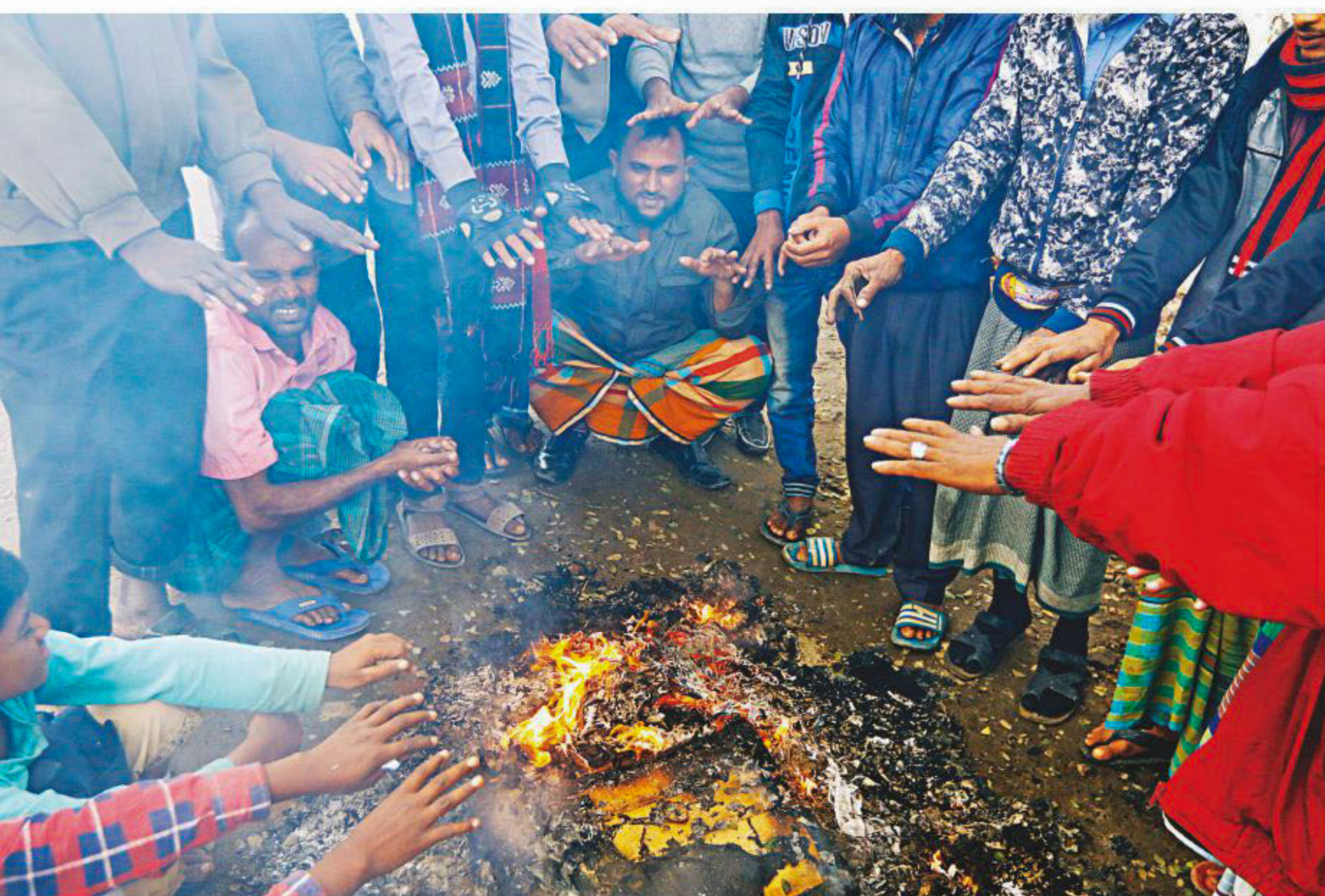
Huddling around fire made in public places to stay warm is a common scene in Bangladesh during winter. This photo was taken at Dhaka's Beribadh area.