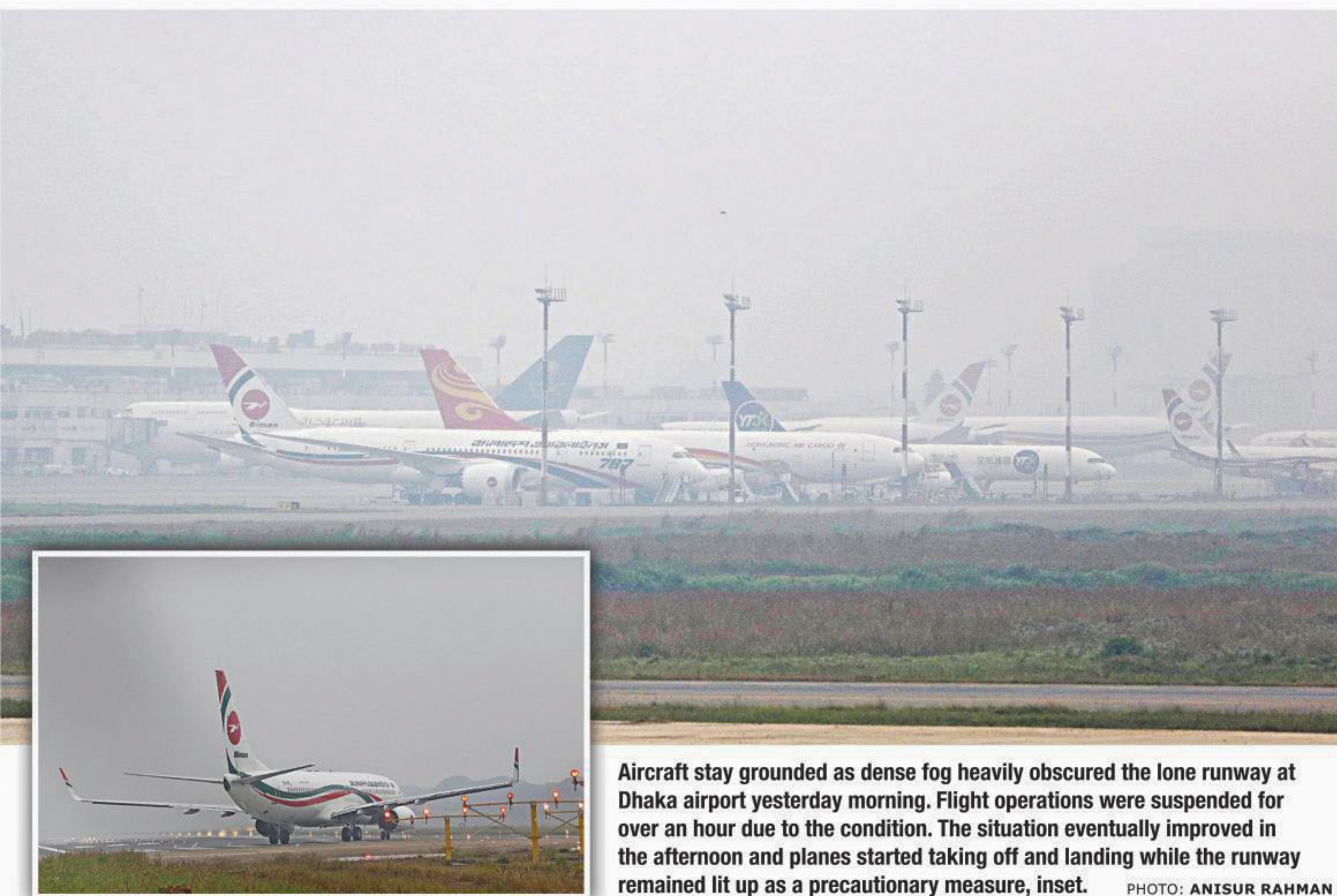
Aircraft stay grounded as dense fog heavily obscured the lone runway at Dhaka airport yesterday morning. Flight operations were suspended for over an hour due to the condition. The situation eventually improved in the afternoon and planes started taking off and landing while the runway remained lit up as a precautionary measure, inset.