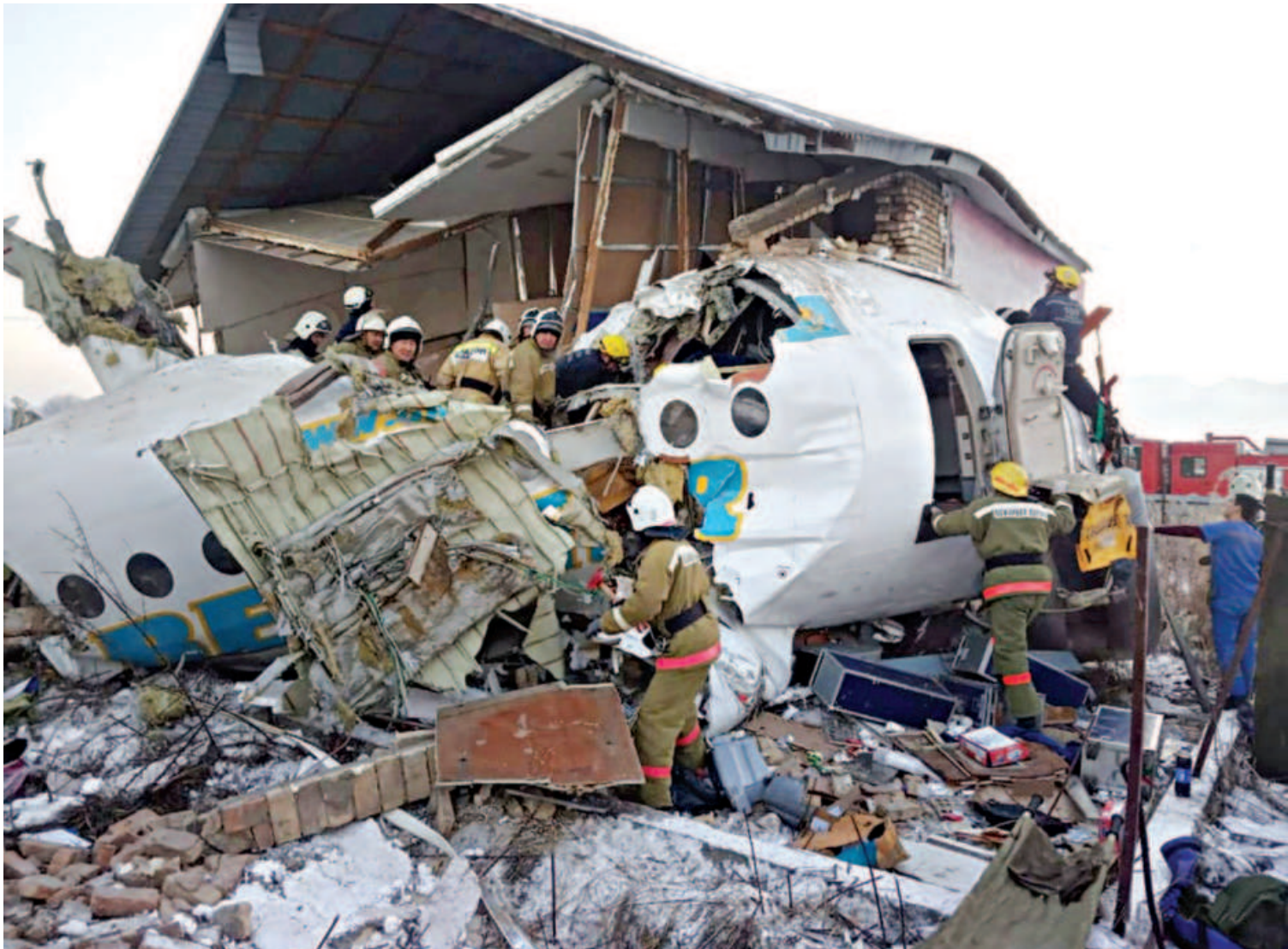
Emergency and security personnel are working at the site of a plane crash near Almaty, Kazakhstan, yesterday.