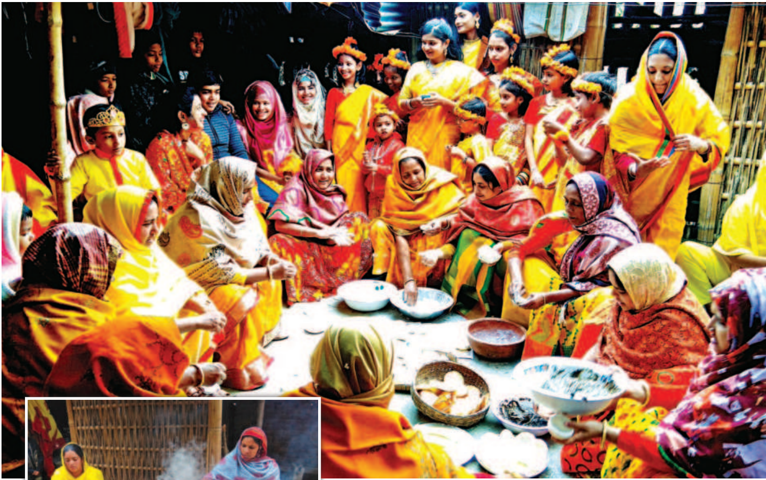
Clad in yellow saris, women prepare pithas (rice cakes) at Nobanno Utsab in Baburghon village of Chapainawabganj's Gomastapur upazila yesterday. The traditional harvest festival is celebrated in rural areas with food, dance and music as new crops bring with them happiness for farmers.

Ash-blackened bare feet and thin, shivering people shuffled about on the premises of Ananda Niketon Model School as a fire blazed through Bauniabandh slum early yesterday. The residents fled with just the clothes on their backs. The fire, which broke out around 12:45am, gutted 87 homes and 17 shops, and left at least 350 people homeless. Eleven fire engines doused the flames around 1:50am, said Ershad Hossain, duty officer at Fire Service and Civil Defence Headquarters. While homes and livelihoods were burnt to a crisp, the people were left freezing as the mercury dipped to 12 degrees Celsius. Shahana and her brother Ratan Miah waited in line to get their names registered as victims. Both were barefoot. Ratan had a thin military-issue blanket wrapped around him, while Shahana shivered in just her cotton sari. "We are originally from Kishoreganj. We lived in the same shanty. It had two rooms that housed each of our families," Shahana told The Daily Star. They both pull garbage carts around the neighbourhood. They have no relative in Dhaka they could seek help from. The cold concrete floor of the school is their only refuge as long as the authorities allow them to stay there. Beside them, 2-year-old Jannatul, exhausted from the night's happenings, dozed off. She wore just a thin shirt and a pair of cotton shorts. Her grandmother Bokula tried SEE PAGE 8 COL 2