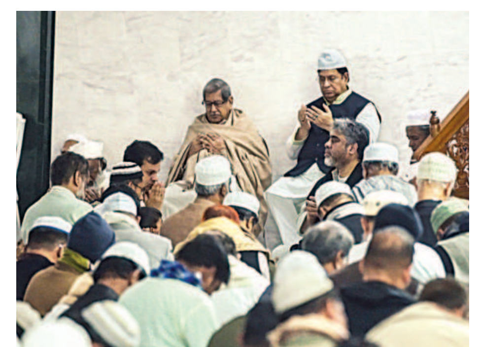
National Professor Anisuzzaman and Foreign Minister AK Abdul Momen, among many others, attended Sir Fazle Hasan Abed's gulkhwani yesterday.