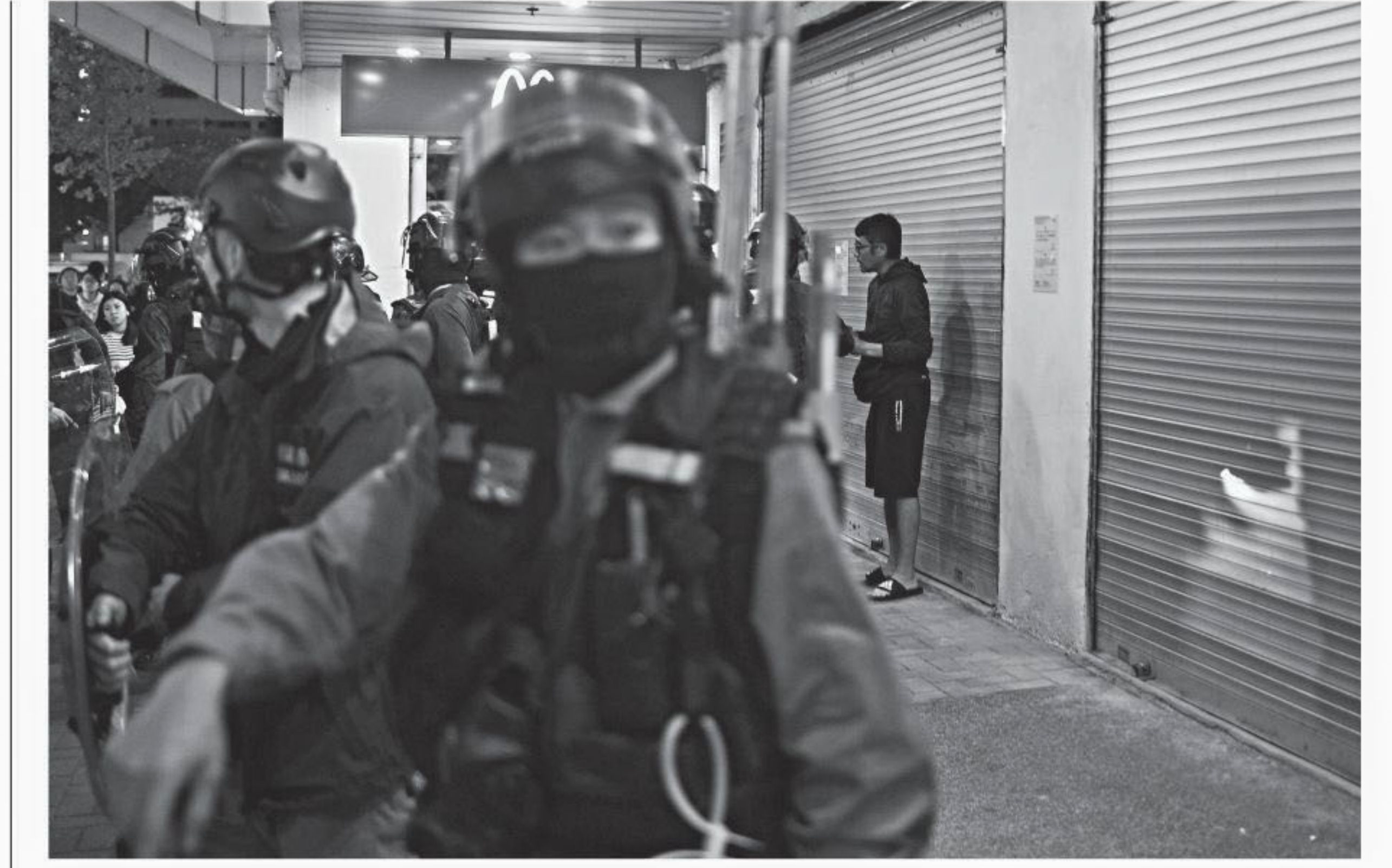
Riot police question a man (R) in the Tai Po district in Hong Kong yesterday. Hong Kong endured a third straight day of political unrest over the Christmas period on December 26 as police and pro-democracy protesters clashed inside shopping malls.