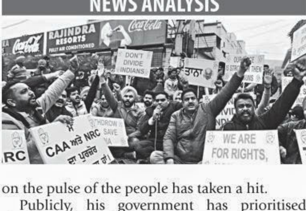
on the pulse of the people has taken a hit. Publicly, his government has prioritised development, seeking to make India a $5 trillion economy by 2025. But Modi's muscular pro-Hindu platform has also gone down well in a nation that is over 80% Hindu: he won back-to-back national elections

REUTERS, Mumbai Indian Prime Minister Narendra Modi's government did not anticipate the protests against a new citizenship law that have raged across the country and is now scrambling to control the damage, members of his ruling party said. In Modi's biggest challenge since taking office in 2014, hundreds of thousands have protested against the law offering citizenship to immigrants from non-Muslim minorities who have fled Afghanistan, Bangladesh and Pakistan. At least 21 people have died in clashes with police. Ruling Bharatiya Janata Party (BJP) leaders were taken aback by the backlash, some party members told Reuters. They said they had been prepared for some anger from Muslims, but not the widespread protests that have convulsed most major cities for two weeks. Now the party and the government are reaching out for help in defusing the crisis to allies and opponents sidelined when the bill passed earlier this month, the sources said. "I really did not see the protests coming ... not just me, other BJP lawmakers were also unable