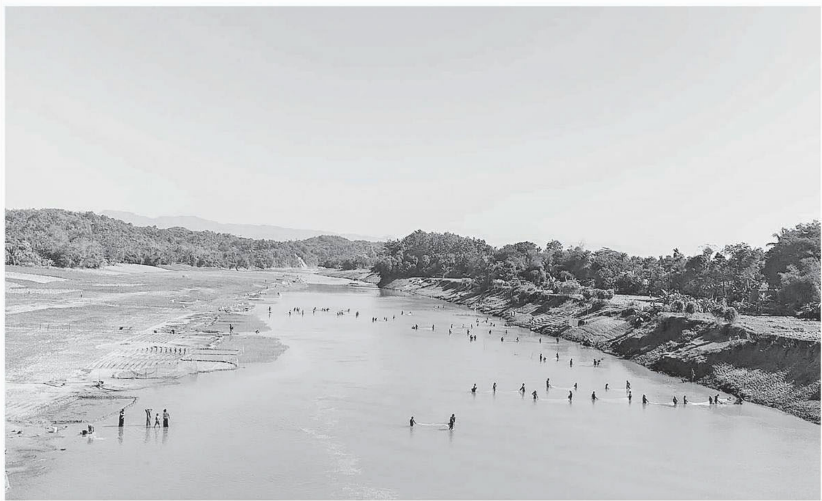
Many locals, including women and children, are seen collecting dead fish after a section of unscrupulous people killed different species of fish in Matamuhuri river in Bandarban's Lama upazila recently.

The secretive bird, seldom seen in the open, prefers to skulk in reed beds and thick vegetation near water bodies. Its presence is apparent in the spring, when the booming call of the male during the breeding season can be heard. It feeds on fish, small mammals, fledgling birds, amphibians, crustaceans and insects.