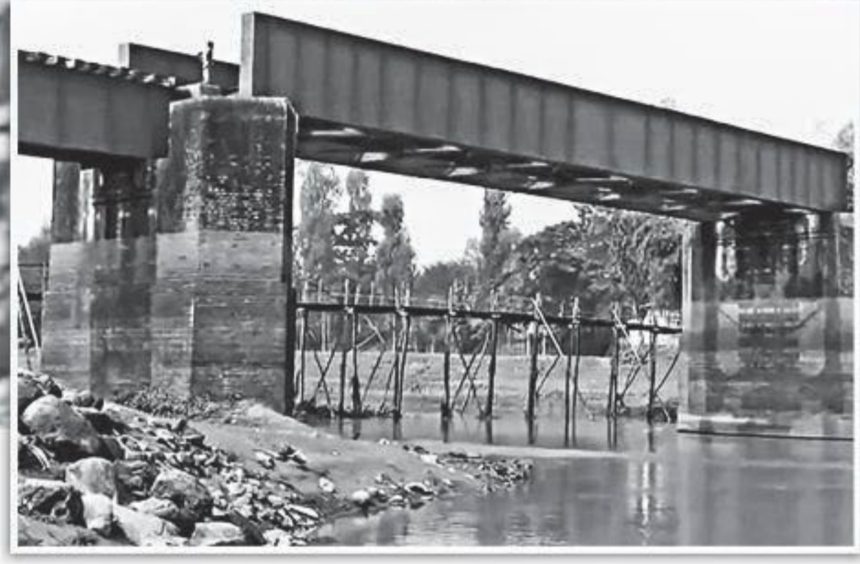
Railway workers take a look at the cracks that developed in one of the piers of the century-old Bheramara rail bridge, inset, over the Ghaghot river near Gaibandha rail station. The photo was taken recently.