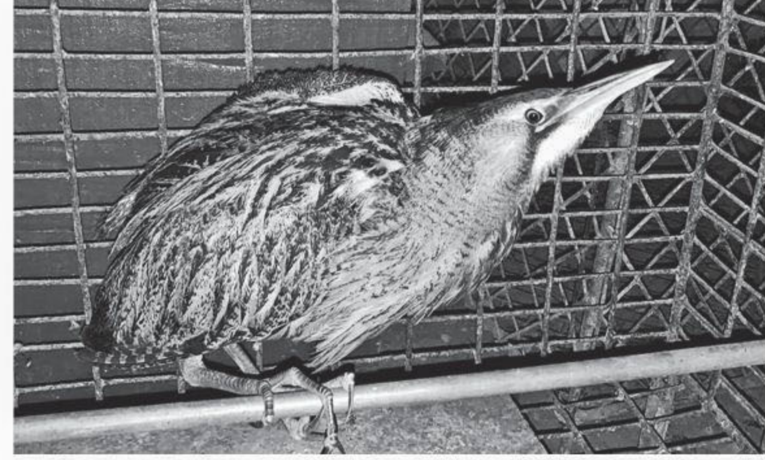
great bittern in 2010 and released it in Hail haor after it made recovery, he added. Bangladesh Bird Club founder