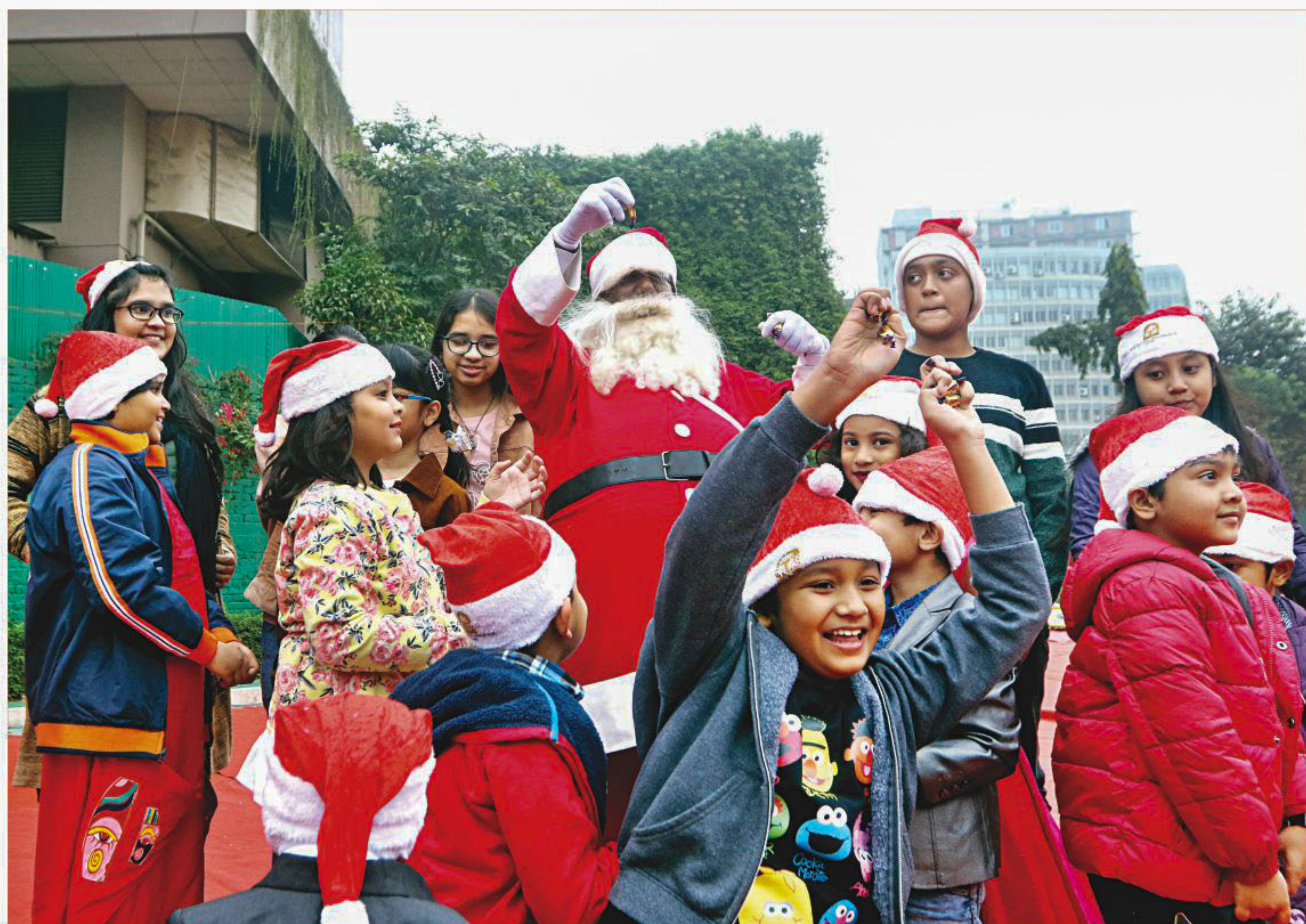
Gleeful children after receiving gifts from Santa Claus on Christmas day yesterday at a hotel in the capital. The biggest festival of the Christians was celebrated across the world.