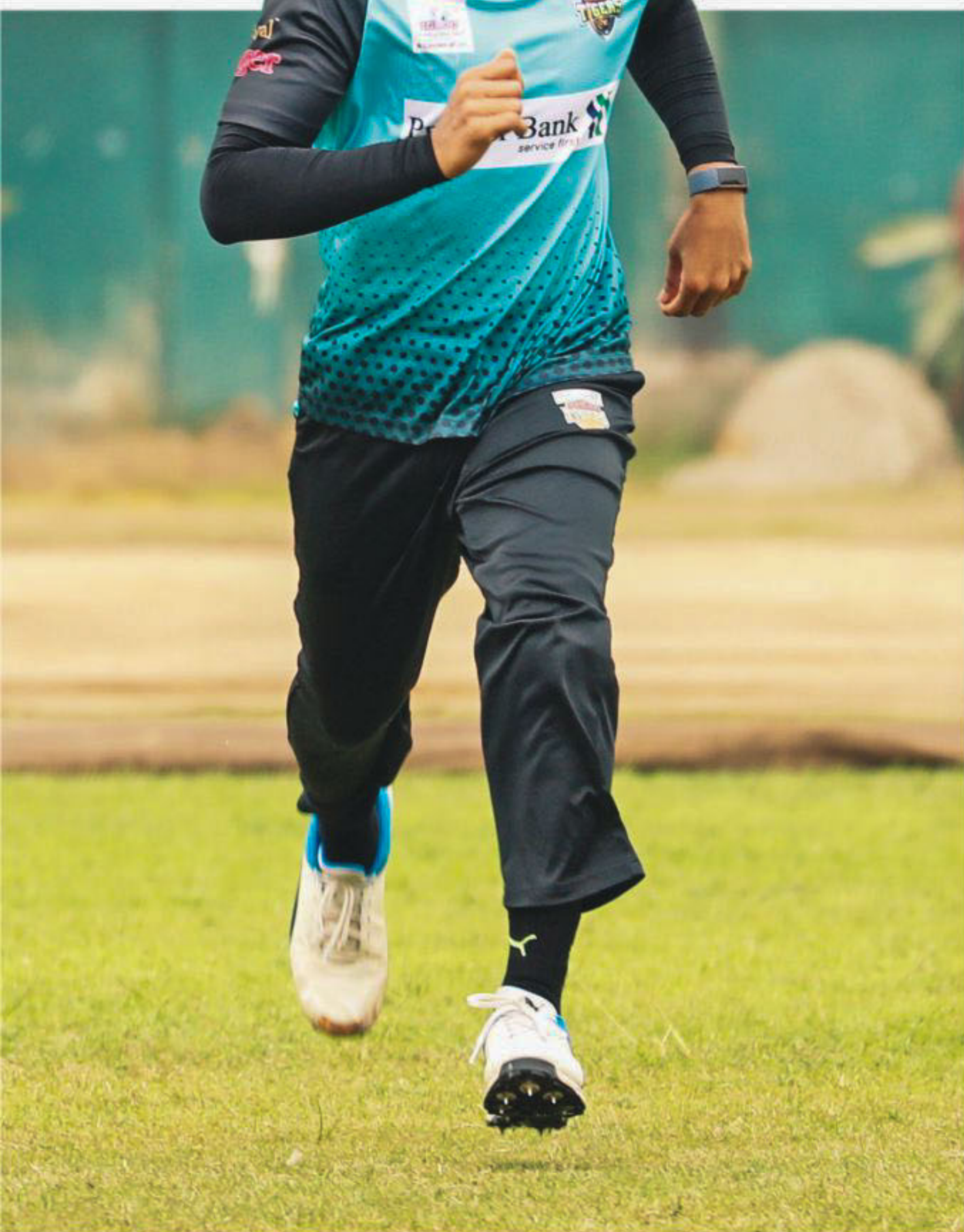
Khulna Tigers captain Mushfiqur Rahim does the hard yards at the Academy Ground in Mirpur yesterday as the Bangabandhu Bangladesh Premier League moved back to Dhaka from a high-scoring Chattogram leg.