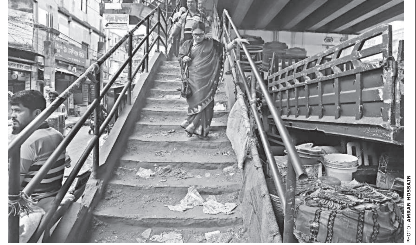
The stairways of this footbridge at Babu Bazar is so worn out that people have a tough time keeping balance. Add the surrounding hawkers and garbage to the mix, and it becomes a nightmare for pedestrians. This photo was taken recently.

She will be buried at her family graveyard at Balia Sonapatila village in Thakurgaon Sadar upazila following the third namaze-janaza after Asr prayers.