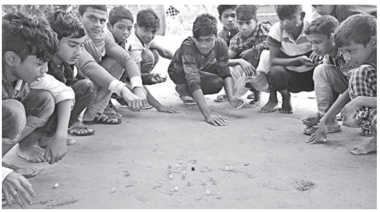
Adolescents at Barishal's Steamer Ghat start their day with a game of marbles. To win, they have to shoot marbles into small holes dug on plain ground. Even in the digital age, the popularity of some traditional games like 'Marble Khela' still endure.